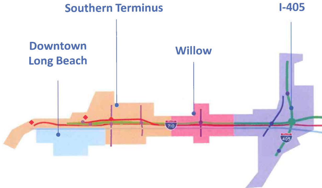
Corridor Communities Long Beach / Signal Hill / Carson