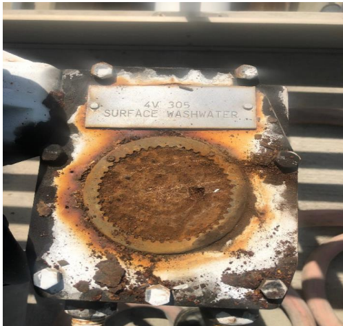
Corroded indicator bracket