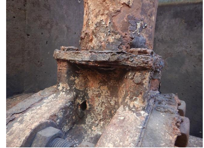
Corrosion on top bonnet cover of valve