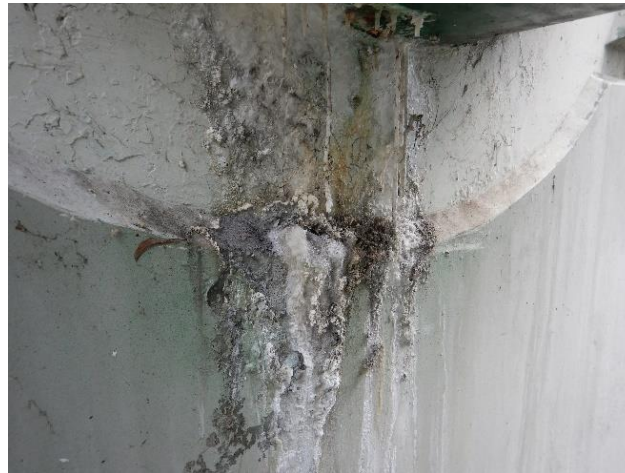
Minor seepage below pipe penetration