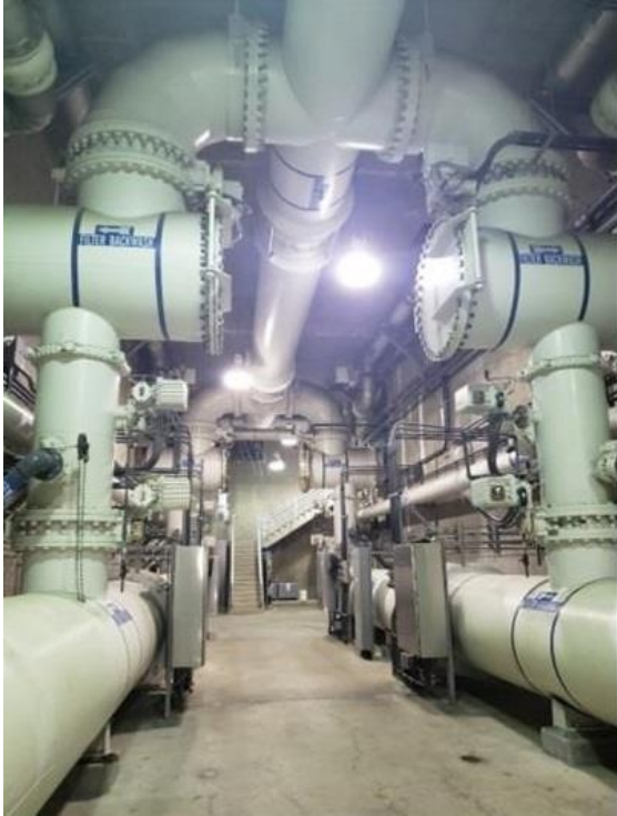
Valves & piping inside the filter gallery