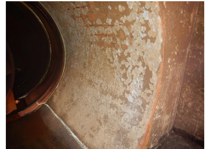
Scouring of mortar lining and corrosion staining at end of spool