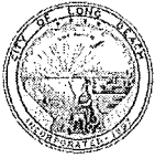
EXHIBIT A UPDATED PROPOSED SCOPE OF WORK FOR EECBG FUNDING

The expanded scope of work for City-wide Municipal Building Energy Efficiency Retrofits (Proposed indicated with *) includes: