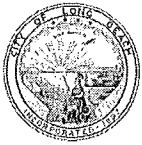
EXHIBIT UPDATED PROPOSED SCOPE OF WORK FOR EECBG FUNDING

The expanded scope of work for City-wide Municipal Building Energy Efficiency Retrofits (Proposed indicated with *) includes: