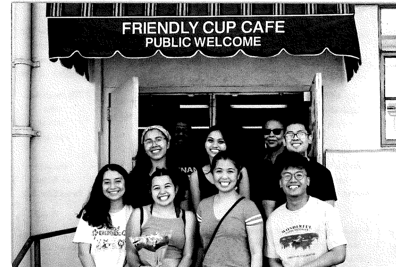
Long Beach Gray Panthers inters from California State Uiveristy Long Beach