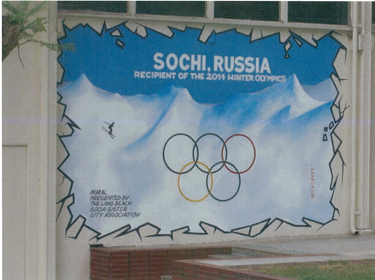
Sochi Mural on the Recreation Park Community Center