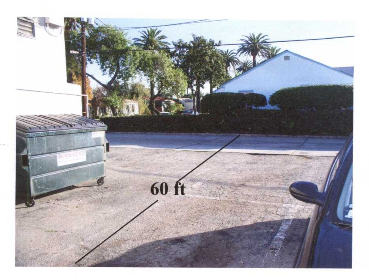
Pic taken by the back door of the Puka Bar