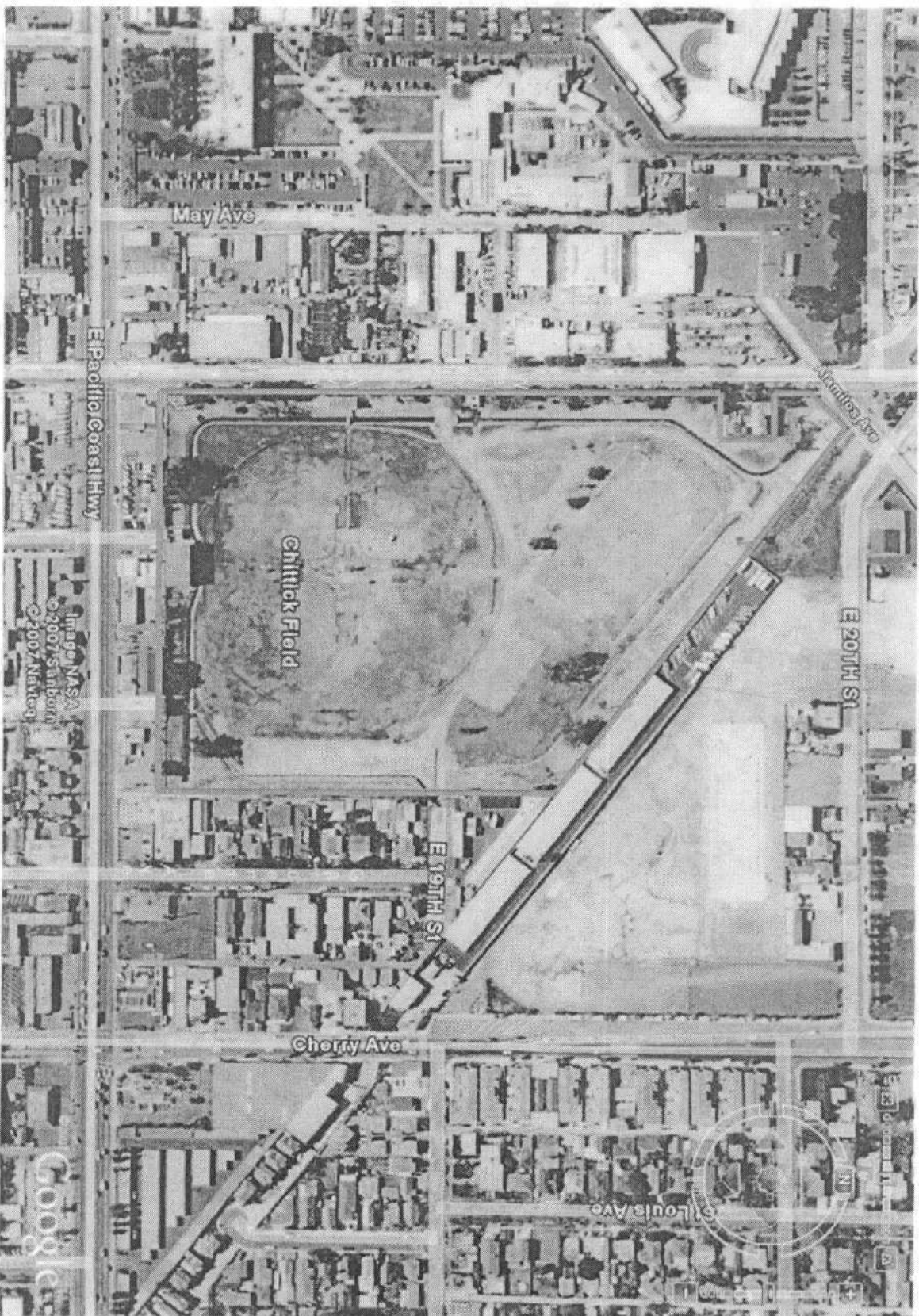
Chittick Field – Hamilton Bowl