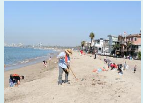
Volunteers working along Peninsula area