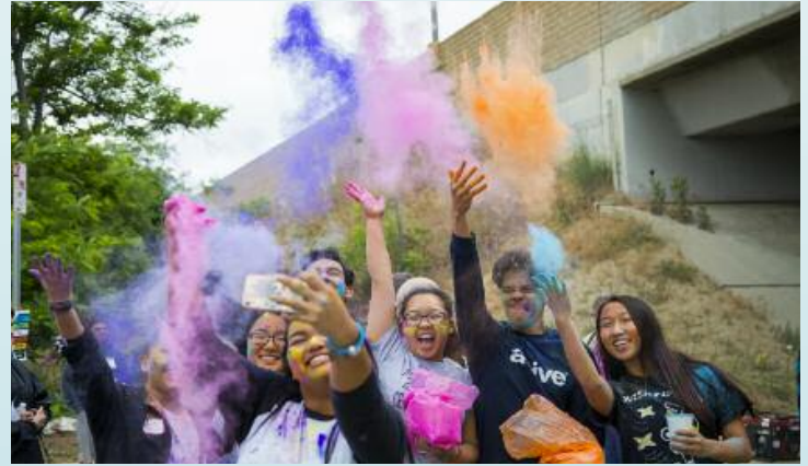
Uptown Open Space Vision Plan Color Block Walk

The Uptown Open Space Vision Plan (Plan) was led by the Office of Councilmember Rex Richardson, PRM, the Department of Health and Human Services, and City Fabrick (a non-profit design studio). The Plan, approved in July 2018, drew upon community input to creatively identify and enhance public open spaces to provide accessibility within a 10-minute walk for residents of North Long Beach. The Plan was formed by a three-phase, community-driven engagement process, which culminated in a "Color Block Walk" event where residents used washable color powders to express possibilities for additional open space.