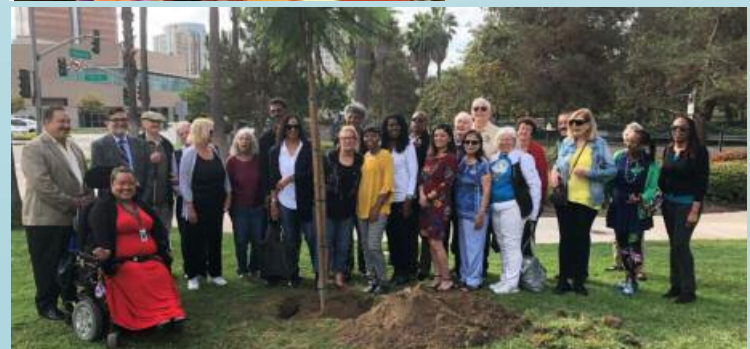
Below: Jacaranda tree planting