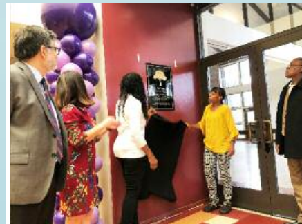
Left: Social Hall plaque unveiling