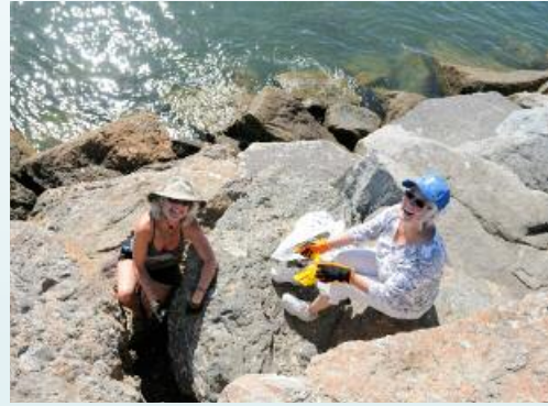
Volunteers cleaning jetty rocks

This annual statewide event draws over 65,000 volunteers in a joint effort to clean up our waterways and coastline.