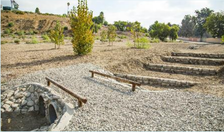
Willow Springs Park

Long Beach Parks, Recreation and Marine (PRM) won two prestigious awards from the California Chapter of the American Planning Association (APA) on October 8, and was recognized for outstanding achievements in the planning field. PRM received the 2018 Public Outreach Award of Merit for the Uptown Open Space Vision Plan and the 2018 Large Jurisdiction Award of Excellence for the Willow Springs Wetlands Restoration Project.