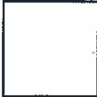
Local Vicinity Map