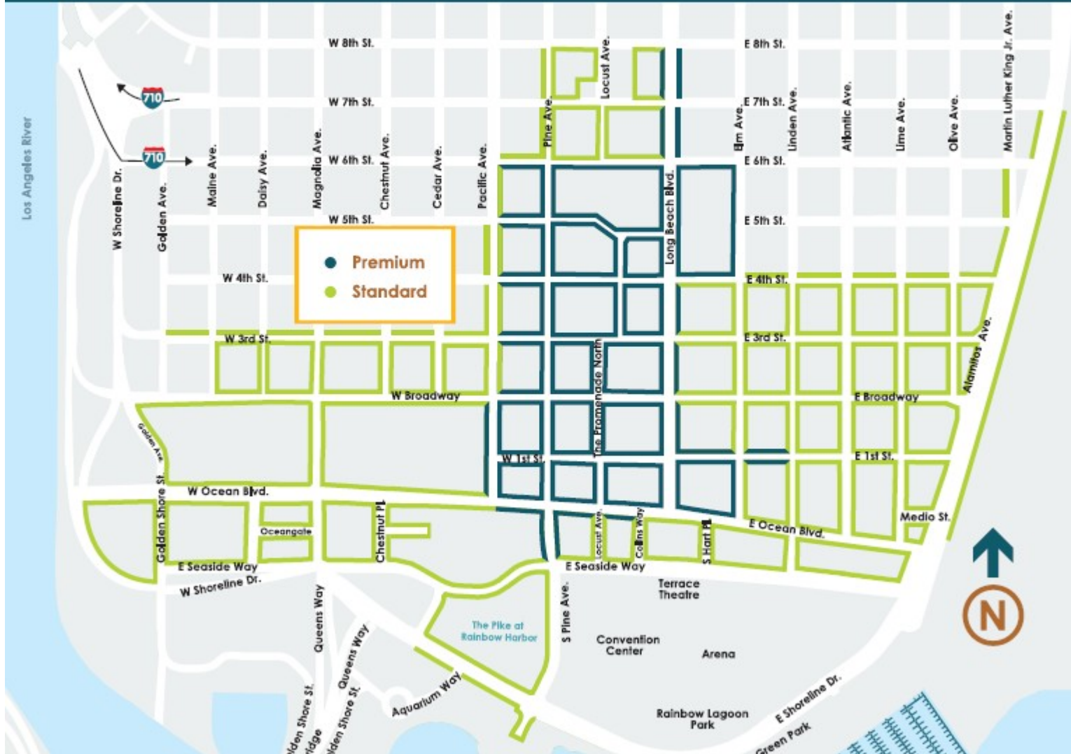
Downtown Long Beach PBID Management Plan FINAL