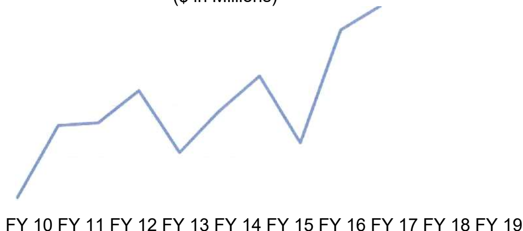
Chart 2. SALES AND USE TAX FY 10 - FY 19 ($ in Millions)

To assist in analyzing trends and assess how to best make future projections, the City retains