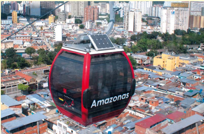
Metro de Caracas, Venezuela