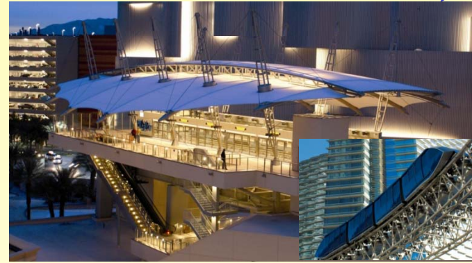
City Center, Las Vegas