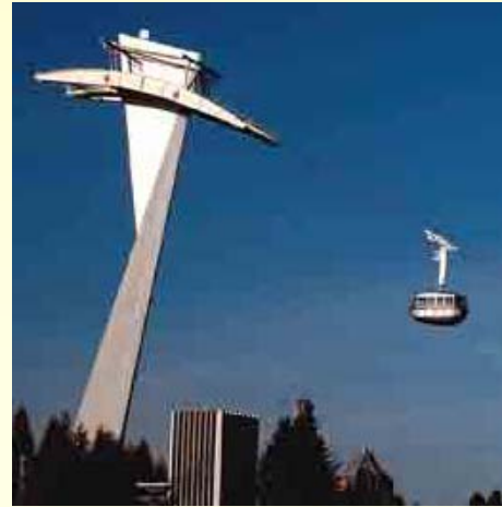
Portland Tram, OR