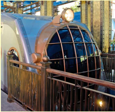
Ocean Park, Hong Kong