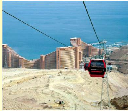
Port Sakhna, Egypt