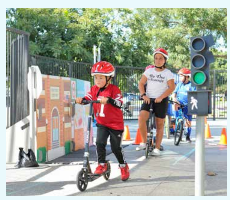
The non-profit Safe Moves organization conducted free bike and pedestrian safety rodeos as part of the pop up events.

Long Beach Parks, Recreation and Marine partnered with the Long Beach Health and Human Services Department's Healthy Active Long Beach program to bring their Mobile Recess vans to neighborhoods on Saturdays and Sundays during September. The eight sites included Miracle on 4th Street Park, Chittick Field, Coolidge Park, Peace Park, M.L. King Jr. Park, Admiral Kidd Park, Houghton Park and Atlantic Plaza Park.