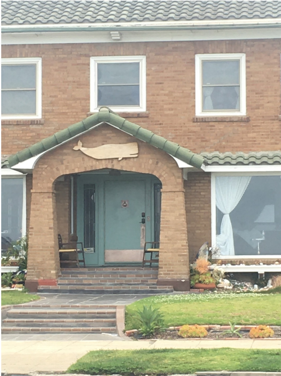
Gable roof porch detail