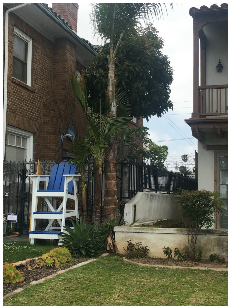
Side elevation - east facing