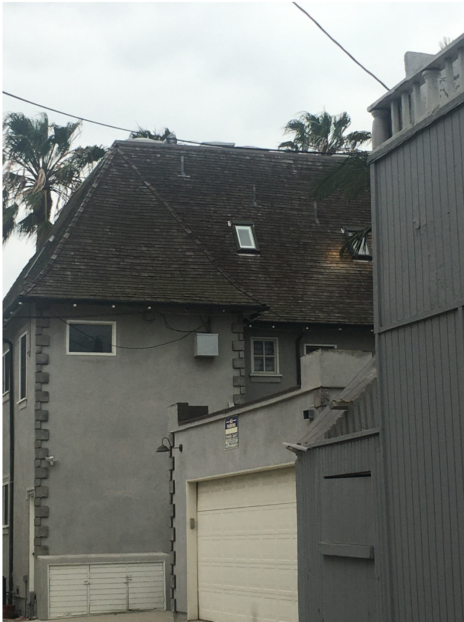
Corner of garage structure and adjacent structures