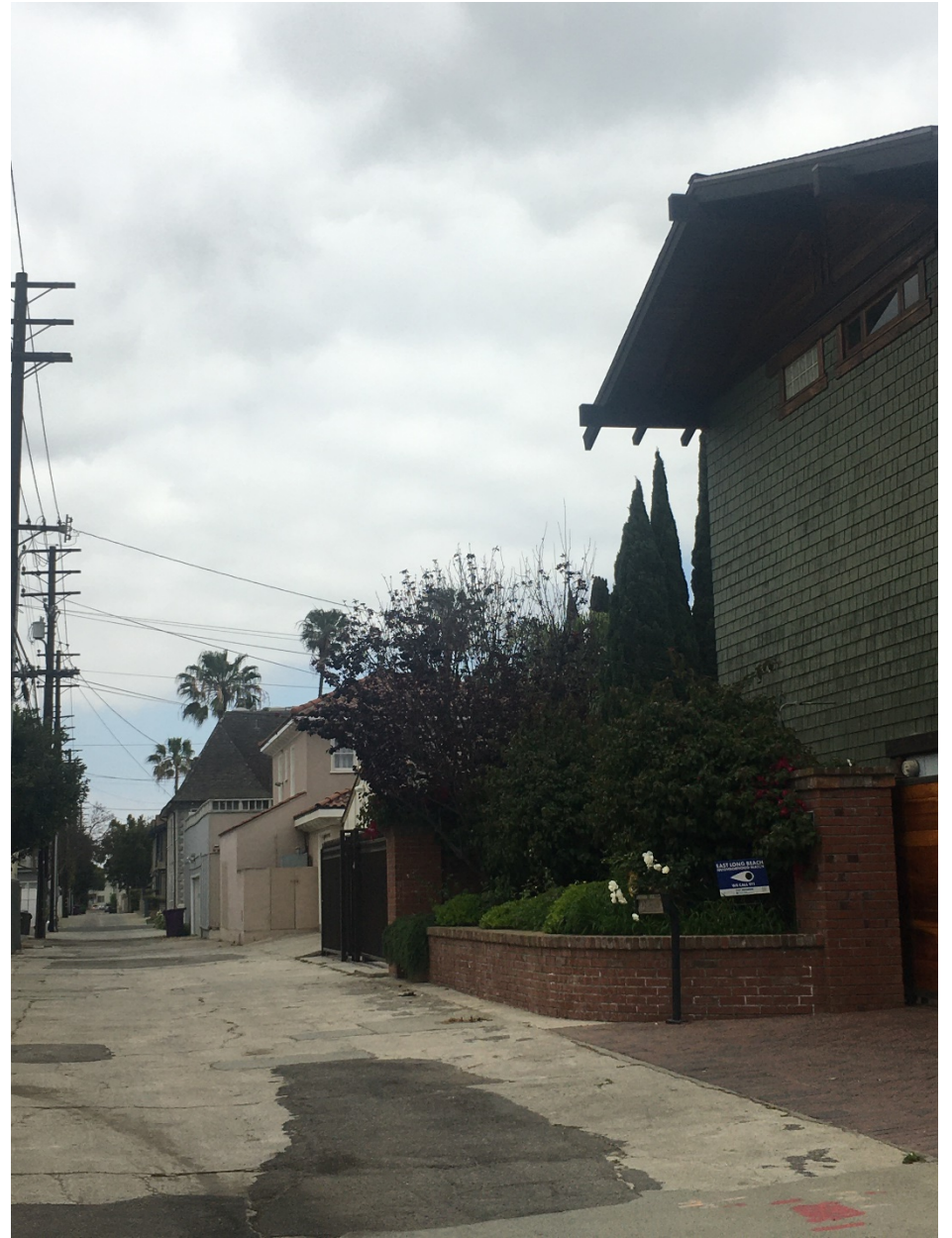
two story structures along alley