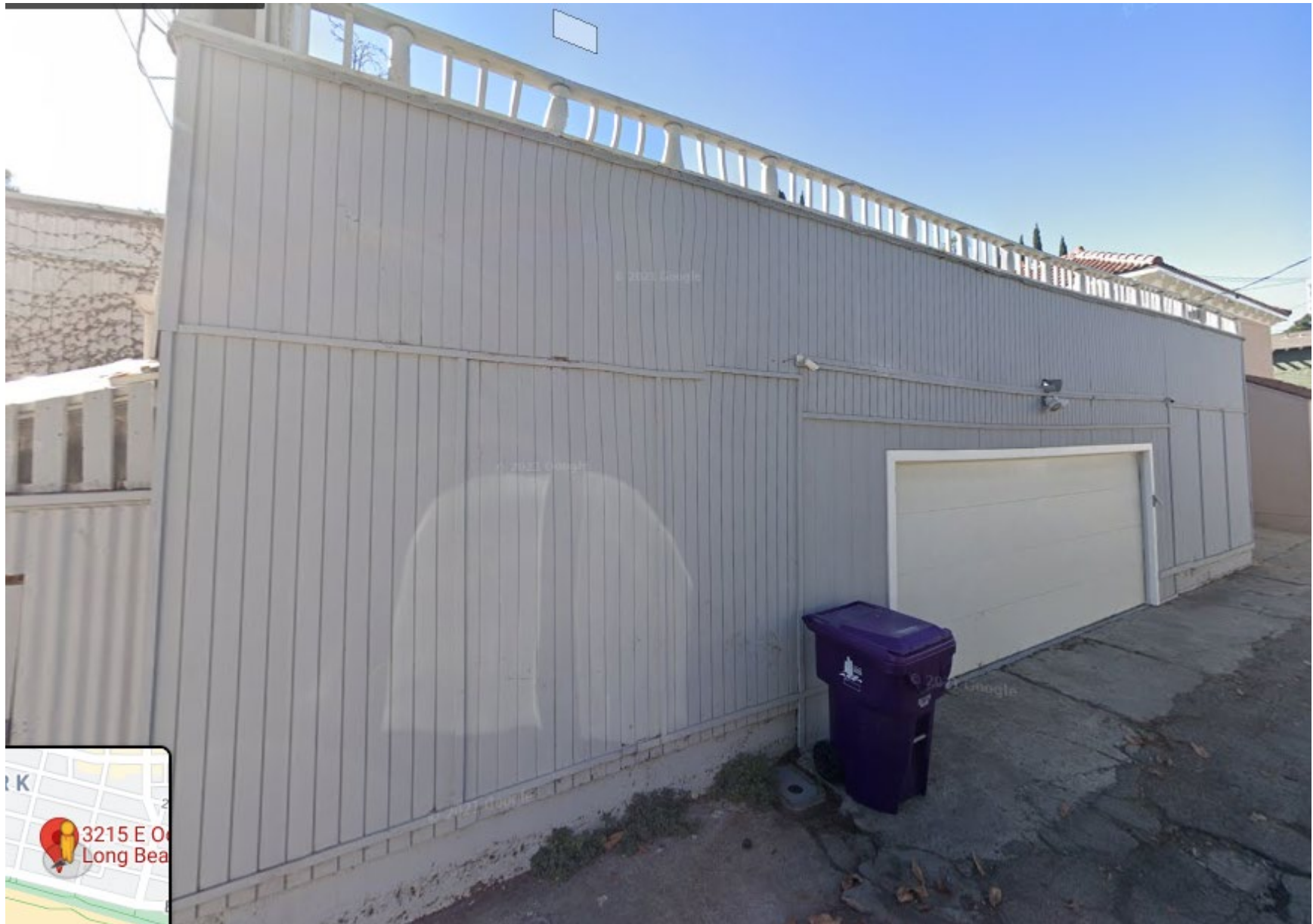
Garage structure to be demolished