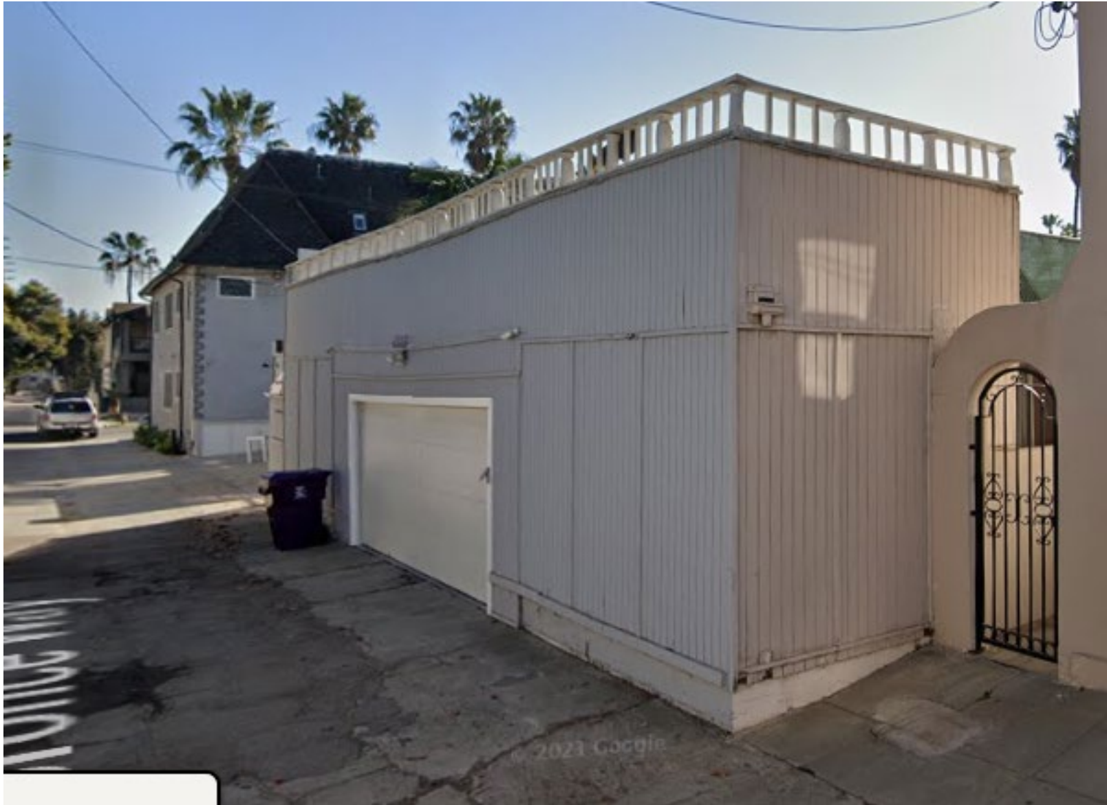
Garage structure - angle view facing east