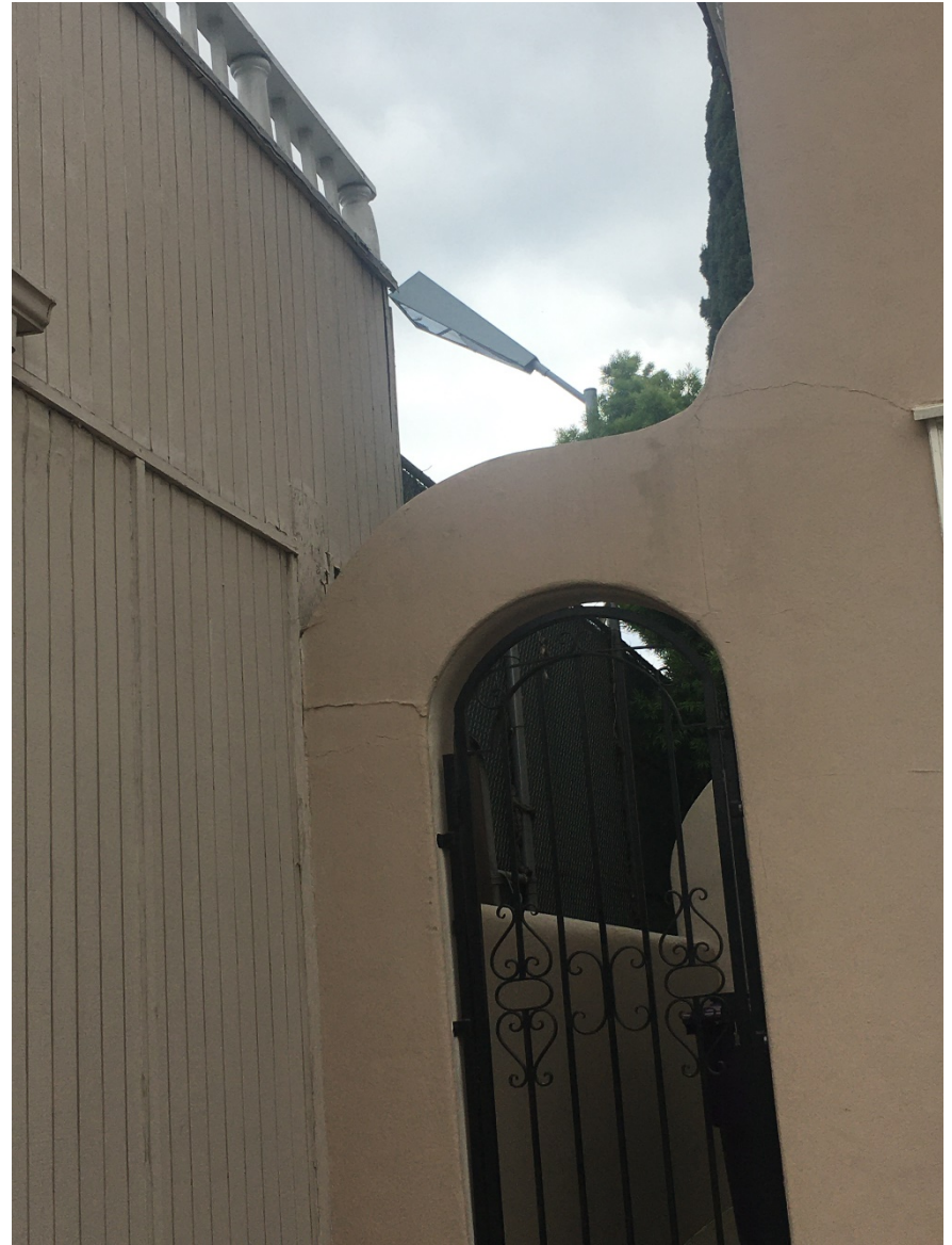
Garage structure and adjacent property pedestrian gate