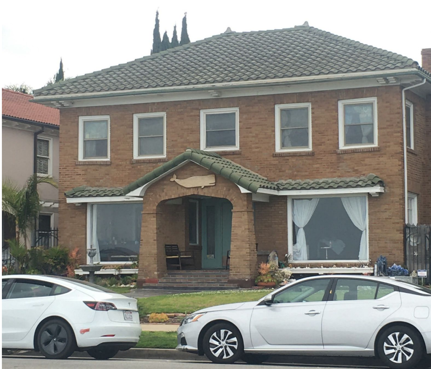
Primary dwelling - Neo-Georgian Architectural Style