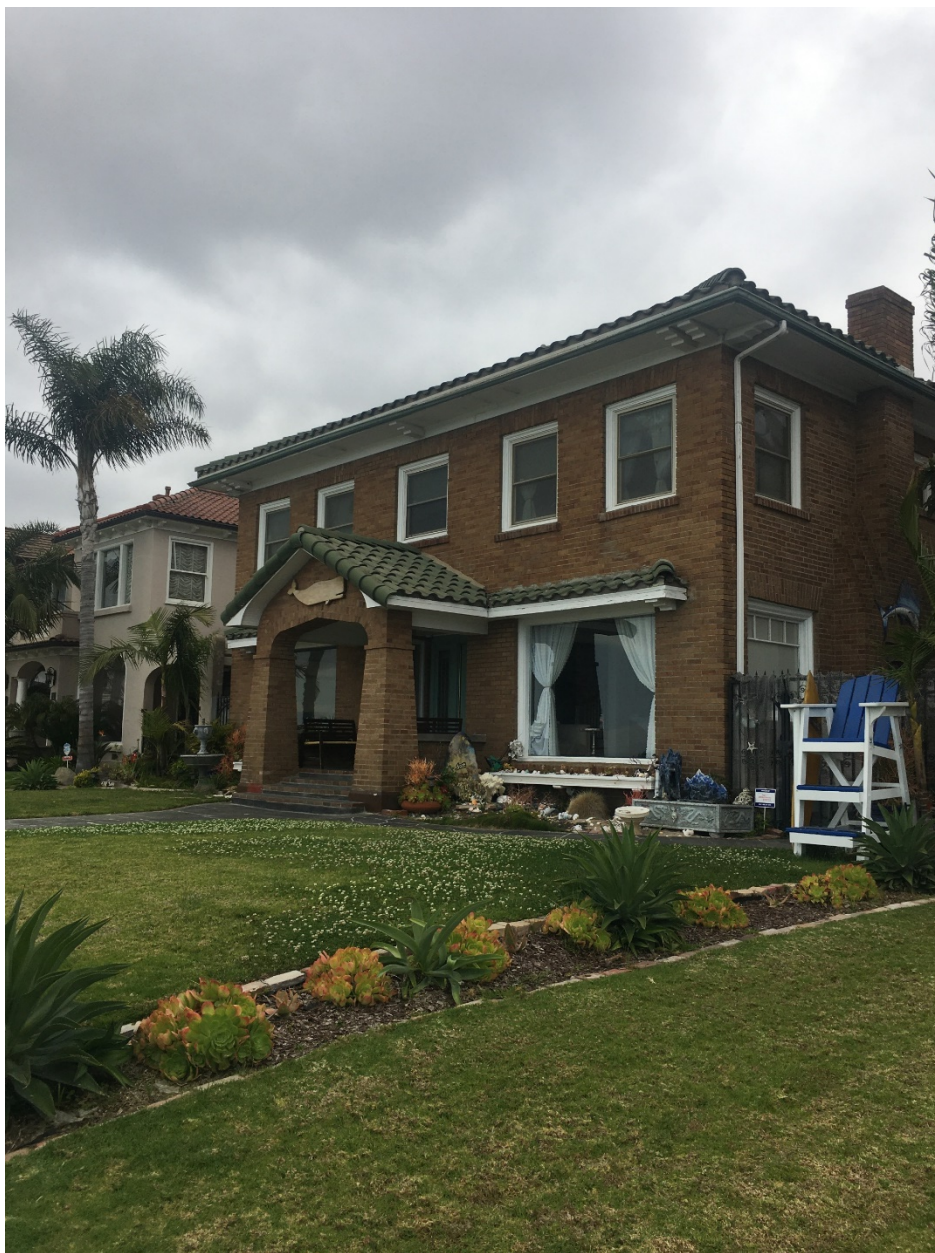
Angle view front and east facing side elevation