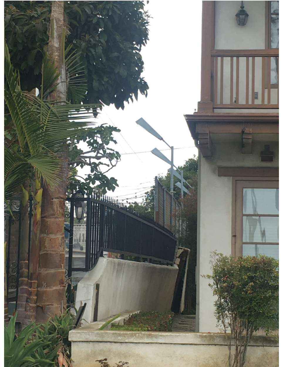
Existing lighting for the tennis court