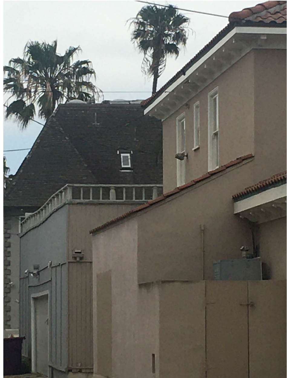
Adjacent properties with two stories