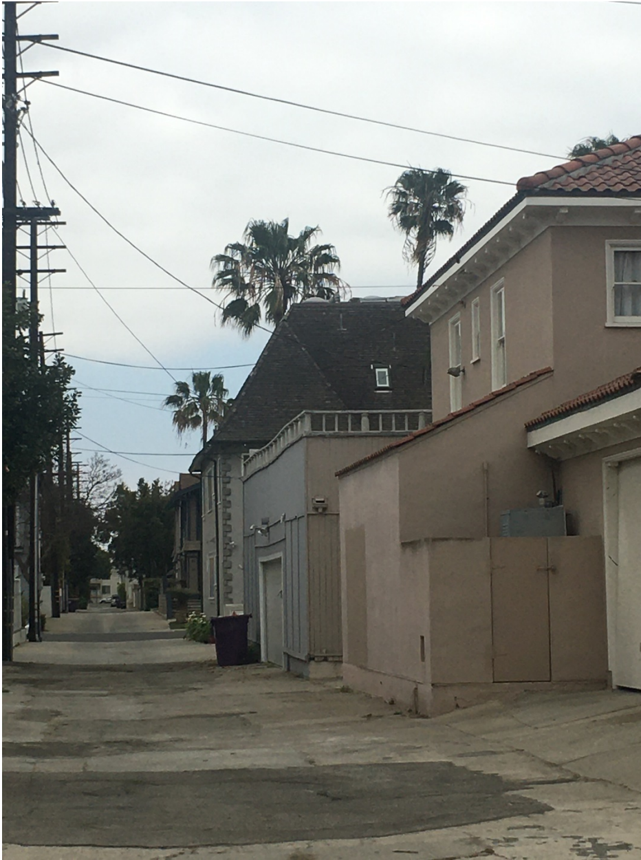
Alley view facing east