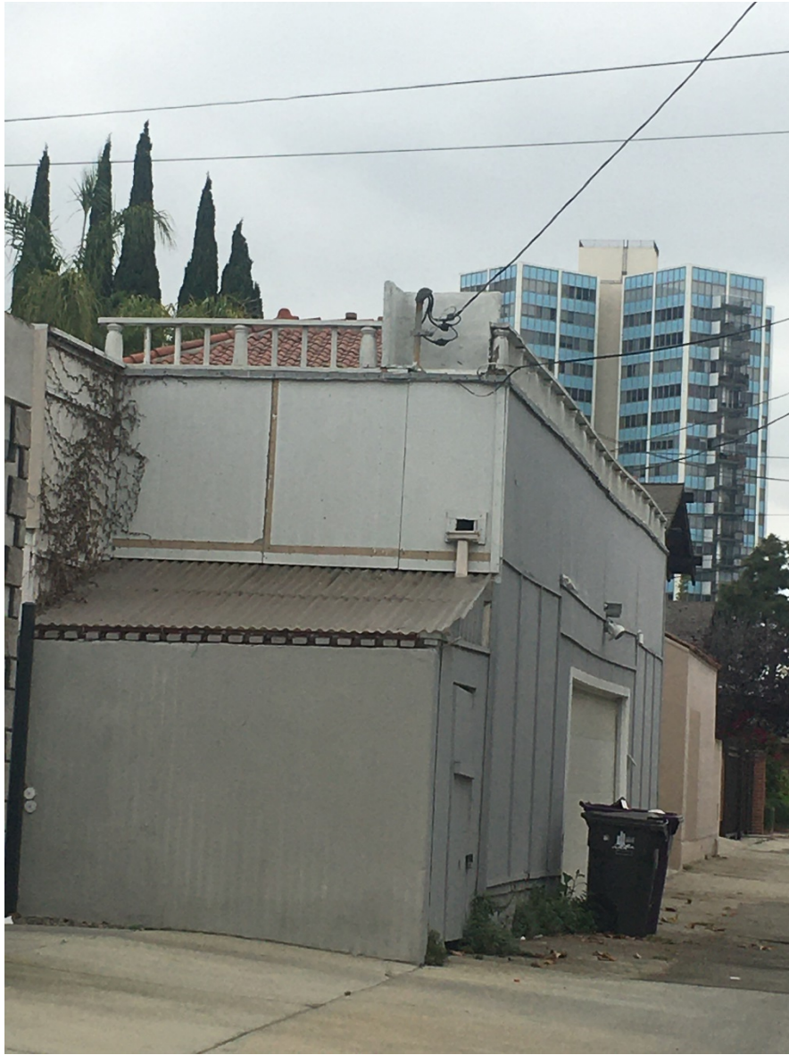
Garage structure - angle view facing west