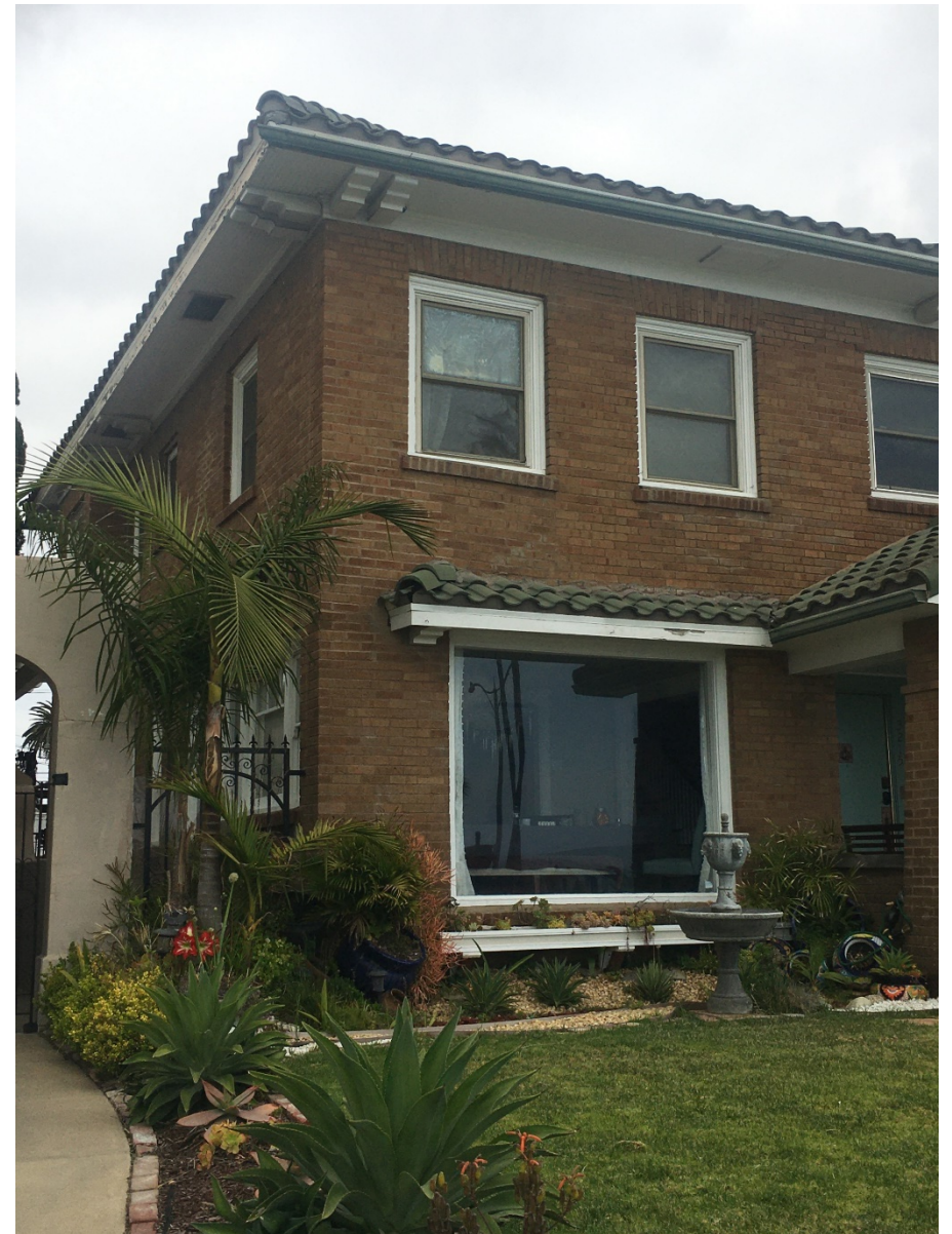
Angle view of front and west facing elevation