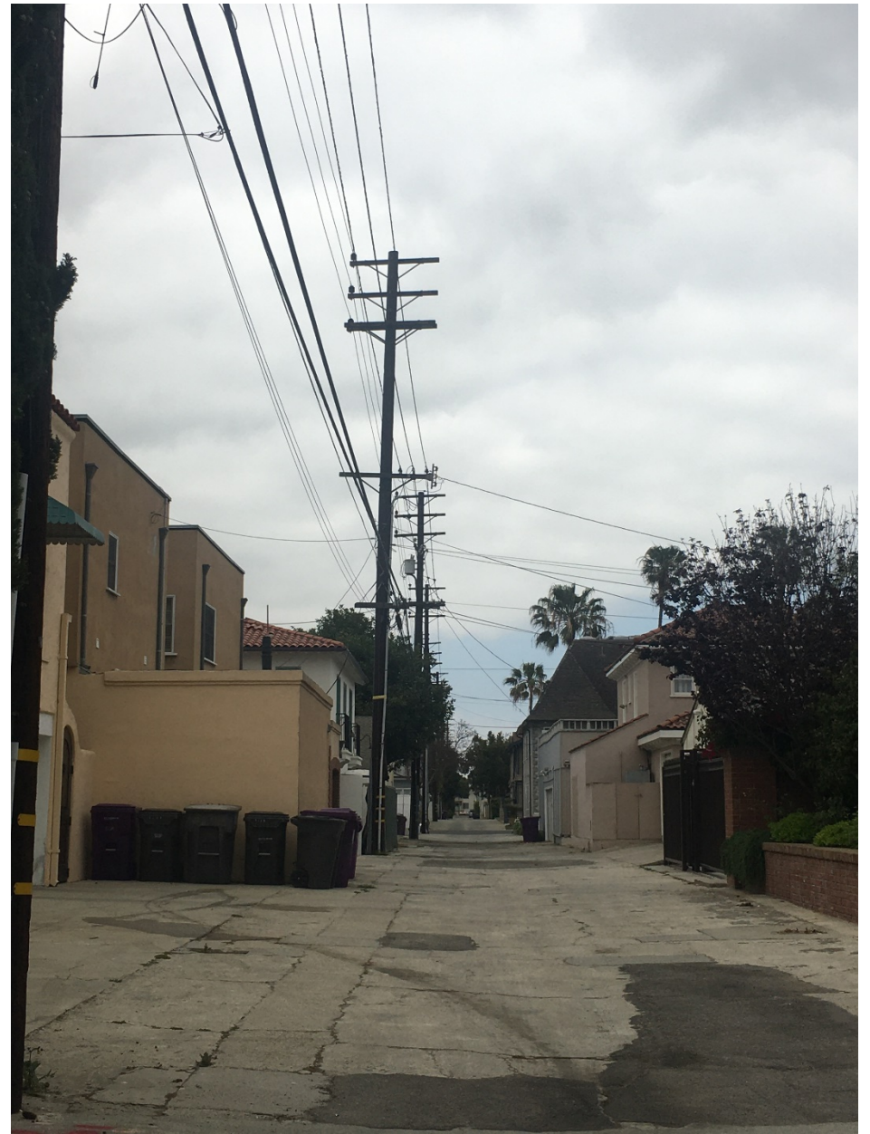
20 foot wide alley - Many 2-story structures