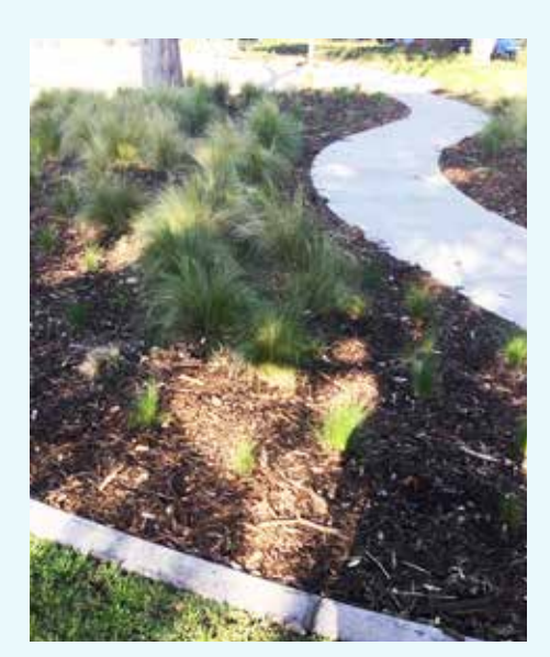
Above left: Nichol Park improvements and brush removal, Middle: Nichol Park after plant replacement project. Right: Native plant enhancements at Orizaba Park.

The Grounds Maintenance team has recently completed projects to enhance our sports fields and irrigation systems at several parks throughout the city as we head into the busy summer months.