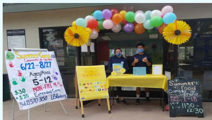
Coolidge Park Ready to Greet Scavenger Hunters

Along the way, participants learned about free and low cost activities provided this summer by PRM for youth and families, including recreation classes, camps, free outdoor movies and the Be S.A.F.E. program.