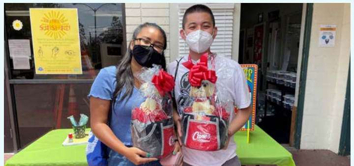
Scavenger Hunt Finishers at Heartwell Park with gift baskets courtesy of Raising Cane's Restaurant.

Long Beach Parks, Recreation and Marine (PRM) kicked off the summer with a "Sunshine Seeker's" scavenger hunt in June that challenged participants to find a small sun with a riddle to solve beside it in the front windows of the community centers at Heartwell, Coolidge, Admiral Kidd King and Recreation Parks. The Sunshine Seekers turned in their completed forms at Heartwell Park to claim prizes including art supplies, puzzles and small toys.