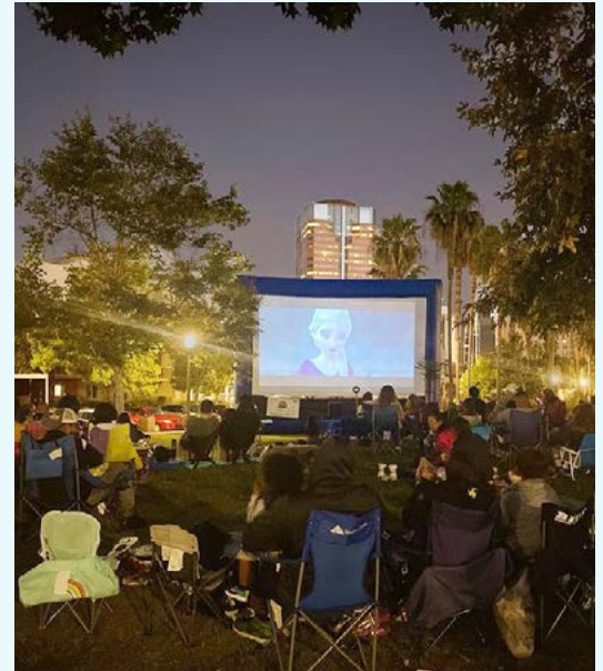
Movies In The Park, a summertime park favorite, resumes in 2021.