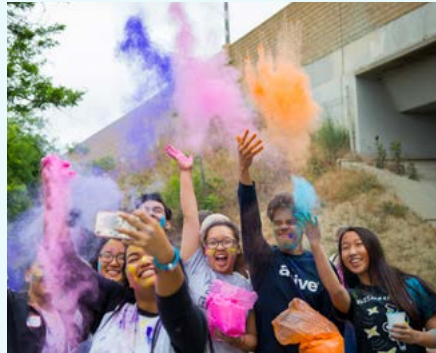
Hamilton Loop project Color Block walk, the final community celebration of the Uptown Open Space Vision Plan. Since then, the Hamilton Loop Vision Plan has further developed the concept for this project.

runs, and garden space was developed through an inclusive community engagement process that evaluated existing conditions and existing bike and pedestrian plans, examined park opportunity tradeoffs, and developed the community-driven vision and implementation strategies.