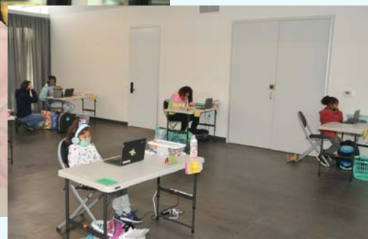
Physical distancing safety guidelines are in place at learning hubs.

The Community Learning Hubs will continue to offer free sessions through March for distance learning and after-school activities for kindergarten to eighth grade LBUSD students.