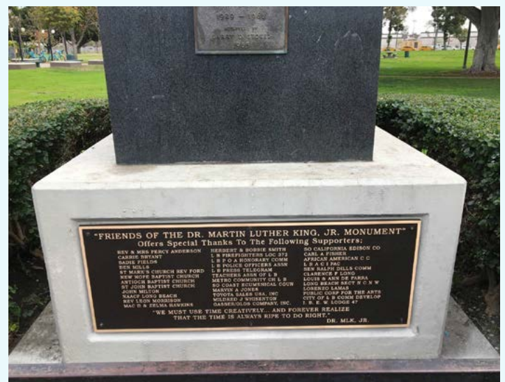
The memorial statue of Dr. Martin Luther King Jr. at King Park received a new bronze plaque.