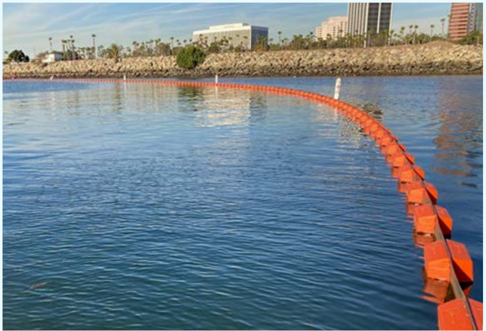
A newly installed boom system aims to keep storm debris away from Golden Shore Reserve and into an adjacent containment area.

This new system is capable of harnessing water velocity as debris flushes out of the river. The goal is to trap the bulk of surface and submerged trash, litter and natural debris and large floating objects.