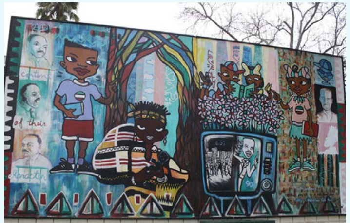
The park's mural "The Content of their Characters" sends a positive message.

For more information about King Park, call 562.570.4405 or visit www.lbparks.org .