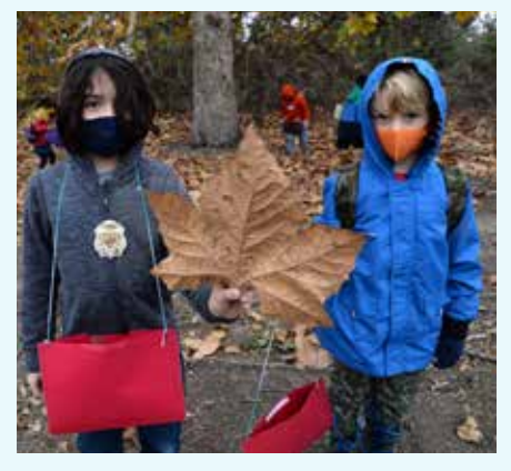
Raw materials came in all shapes and sizes.