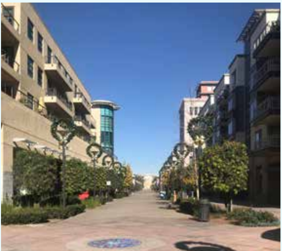
Promenade Square Park offers precious open space to residents of downtown Long Beach.

The .68-acre Promenade Square Park located at 215 E. First Street near The Promenade is a vital patch of green that provides downtown residents with much need open space.