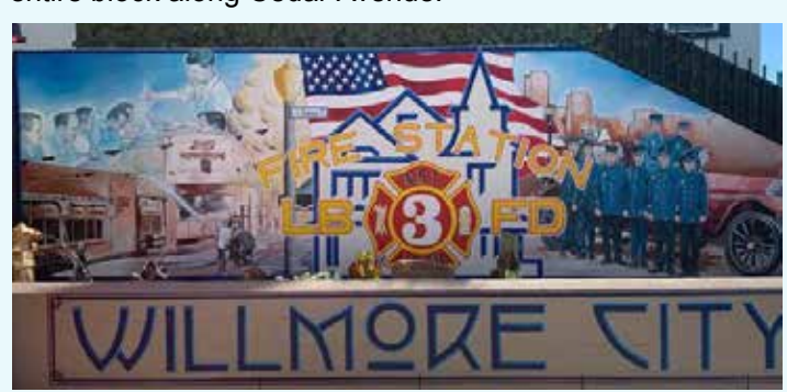
The artist duo created this mural for Fire Station 3

In December, the two removed gang graffiti that stretched an entire block along Cedar Avenue.