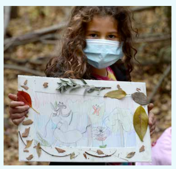
Creating art inspired by nature, suitable for framing.

Participants in the "Winter Wonders" session on December 24 celebrated the season with inspiration from nature. They brought the outdoors in, creating their own wintery decorations.