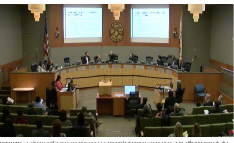
Sacramento CA city council is ready to allow 10 new cannabis dispensaries to open in an effort to remedy the long-standing equity issues in the city's retail marijuana market, bringing the total pot shops to 40. BY DAVID CARACCIO

JANUARY 15, 2020 01:29 PM , UPDATED JANUARY 16, 2020 05:15 PM