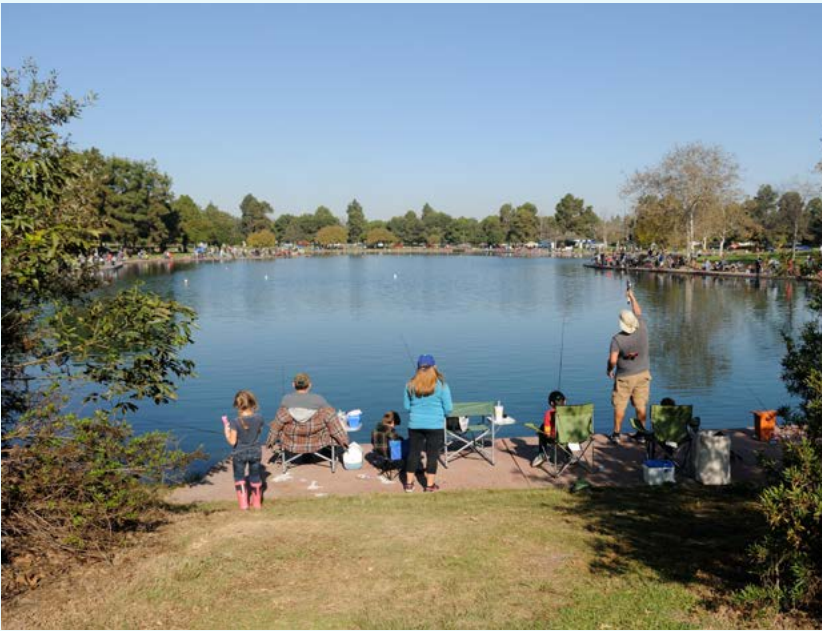
A Parks, Recreation and Marine gift certificate parking pass is the perfect gift for anyone who is a nature lover on your holiday list.

An annual parking pass to El Dorado Regional Park is a great idea for the fisher, dog lover, archer, model boat or plane enthusiast, or nature lover on your gift list this holiday season.