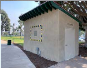
Bixby Parcel One includes a free-standing restroom, new irrigation system and landscaping.