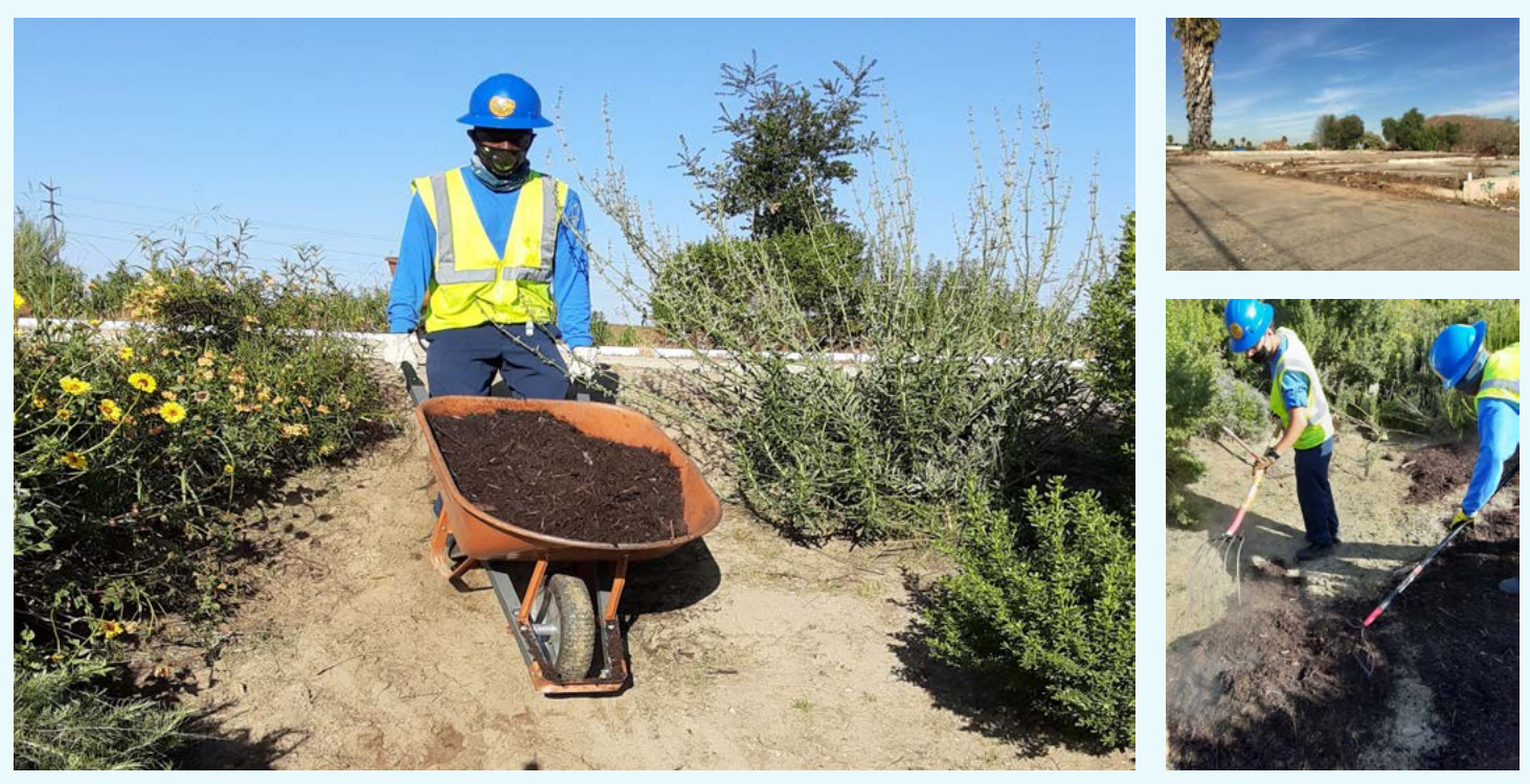
The Conservation Corp of Long Beach partners with PRM to maintain 15 acres of Willow Springs Park and provide job training to at-risk youth.