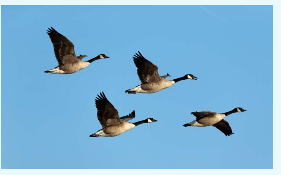
Catch a glimpse of the Canadian Goose migration at the El Dorado Nature Center. Nature trails are open Tuesday-Sunday 8 a.m.-5 p.m.

A great example of a migratory bird is the Canada Goose. Although we have plenty that have decided to permanently reside in our parks, you might see a few flying up above in a V formation as they make their way down south. During your next visit, keep an eye out to see if you can spot a bird who might be making a pit stop!