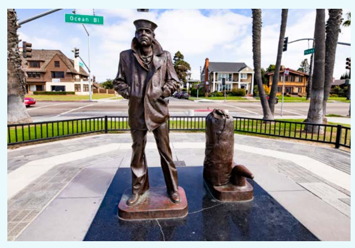
The Lone Sailor Memorial overlooking the Pacific Ocean stands in memory of those who have served our nation in a naval capacity.

As a former Navy town that once was home to the Long Beach Navy Base, it is fitting that Long Beach is the site of the Lone Sailor Memorial at Ocean Blvd. and Paloma Ave. The statue commemorates the past and present service of all men and women who have served and continue to serve our nation on the seas.