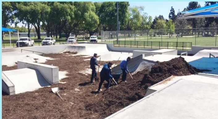
Resourceful Maintenance Operations staff filled the El Dorado Skate Park with mulch to deter skaters from congregating.

For the safety of residents during the COVID-19 pandemic, many PRM facilities, beaches, and park amenities were closed over the past two to three months. To secure these areas, staff fanned out across the city to install locks and closure signs around park equipment