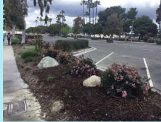
Mother's Beach Before and After

Parks Maintenance Supervisor Jeff King and Gardner II Alex Perez implemented a landscape revitalization plan throughout Alamitos Bay and the Downtown Marinas. The work included sprucing up the Mother's Beach parking lot perimeter near to Appian Way by removing old landscape, and installing purple and bronze Flax and Pink Lady Raphiolepis plants and mulch to fill bare spots and give the area an appealing look.