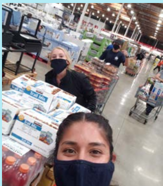
Recreation staff assigned to the Food Unit for the Incident Management and Emergency Operations Centers coordinate 2,000 meals at nine sites, four times each day for COVID response personnel including Police, Fire and National Guard.

Parks, Recreation and Marine (PRM) employees have risen to the challenges of helping to ensure safety and stability for residents during the COVID-19 pandemic.