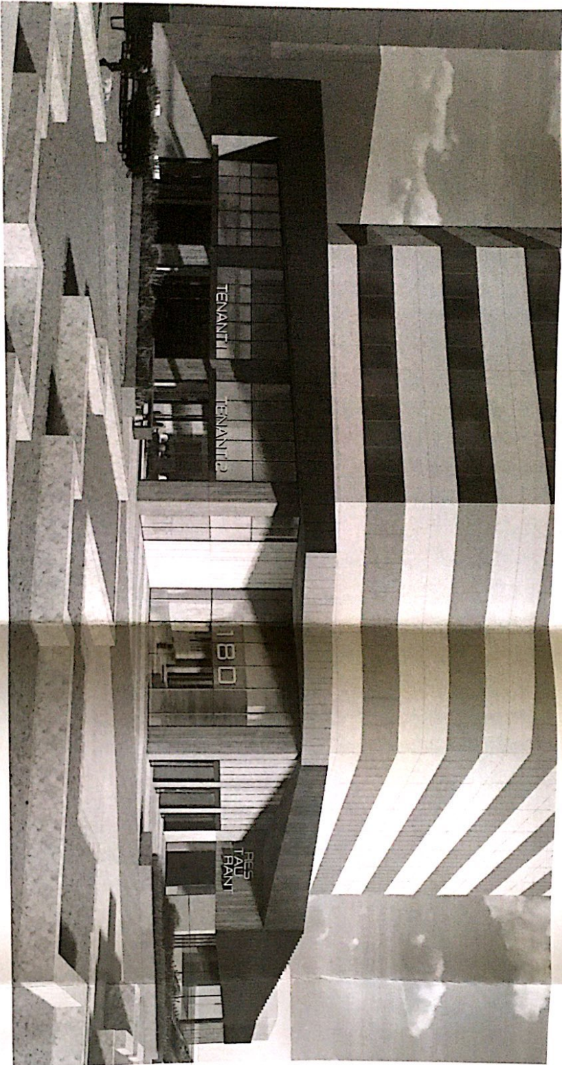
RENDERING OF BUILDING ENTRY FROM VICTORY PARK