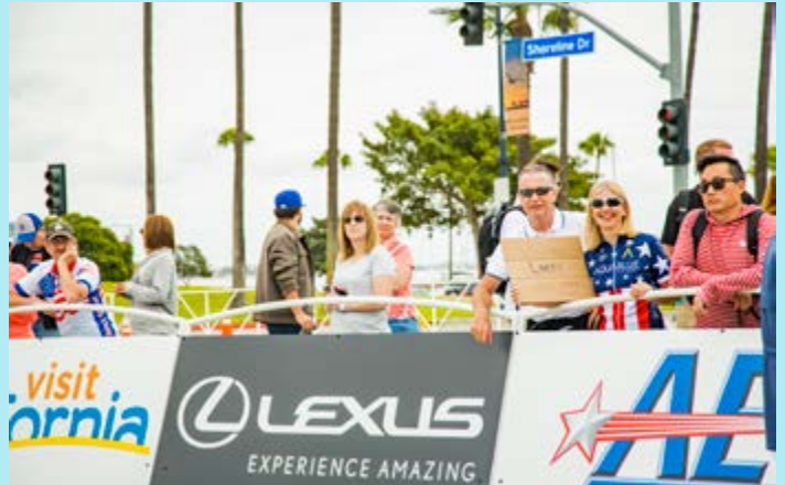
Amgen Bicycle Tour Venue

Charity walks and runs, pro beach volleyball events, car shows, music festivals and the annual Long Beach Pride Festival and Acura Grand Prix of Long Beach are just some of the regular activities that occur each year at Marina Green Park.