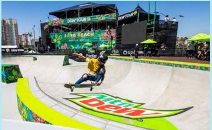
DEW Extreme Sports Tour Venue