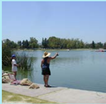
An archery range and two stocked fishing lakes are just a few of the outdoor activities you can enjoy at El Dorado East Regional Park.

Join fellow park-lovers to clean up fishing line and other debris from our beautiful park and lakes.