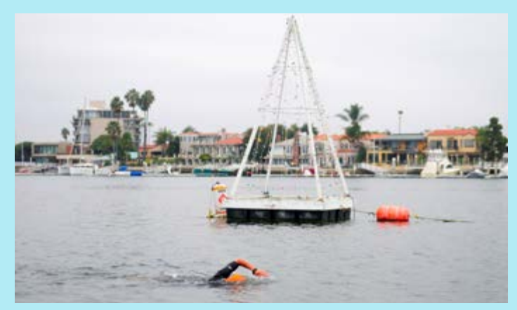
Swimmer passes a tree in Lower Alamitos Bay

2019 marks the 70th year that Long Beach residents and visitors have enjoyed the colorful, festive tree structures floating in the City's waterways.