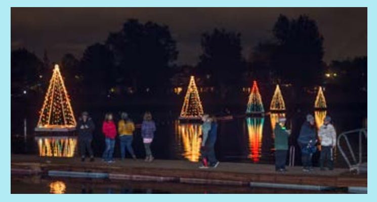
Lighting Ceremony at Colorado Lagoon on November 29

During December, residents and visitors can enjoy colorful lighted trees at waterfront locations including Alamitos Bay, Belmont Veterans Memorial Pier, Rainbow Lagoon, Rainbow Harbor, Spinnaker Bay, Colorado Lagoon, and the lakes at El Dorado West and Heartwell Parks.