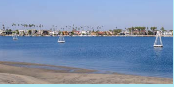
Trees in Peninsula Beach area