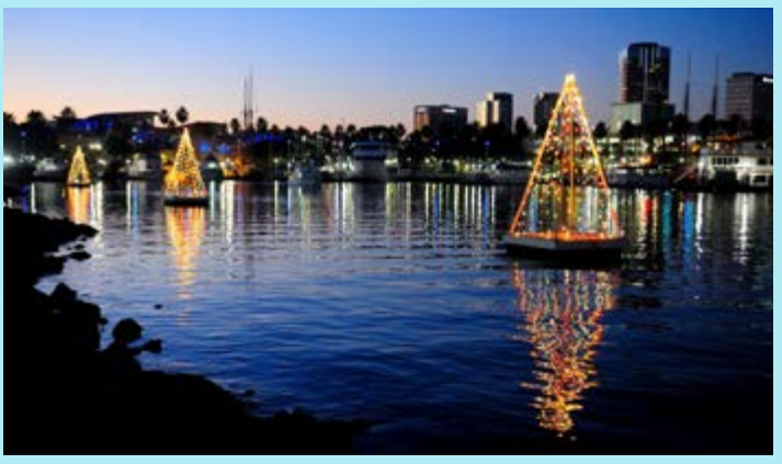
Rainbow Harbor aglow for the holidays