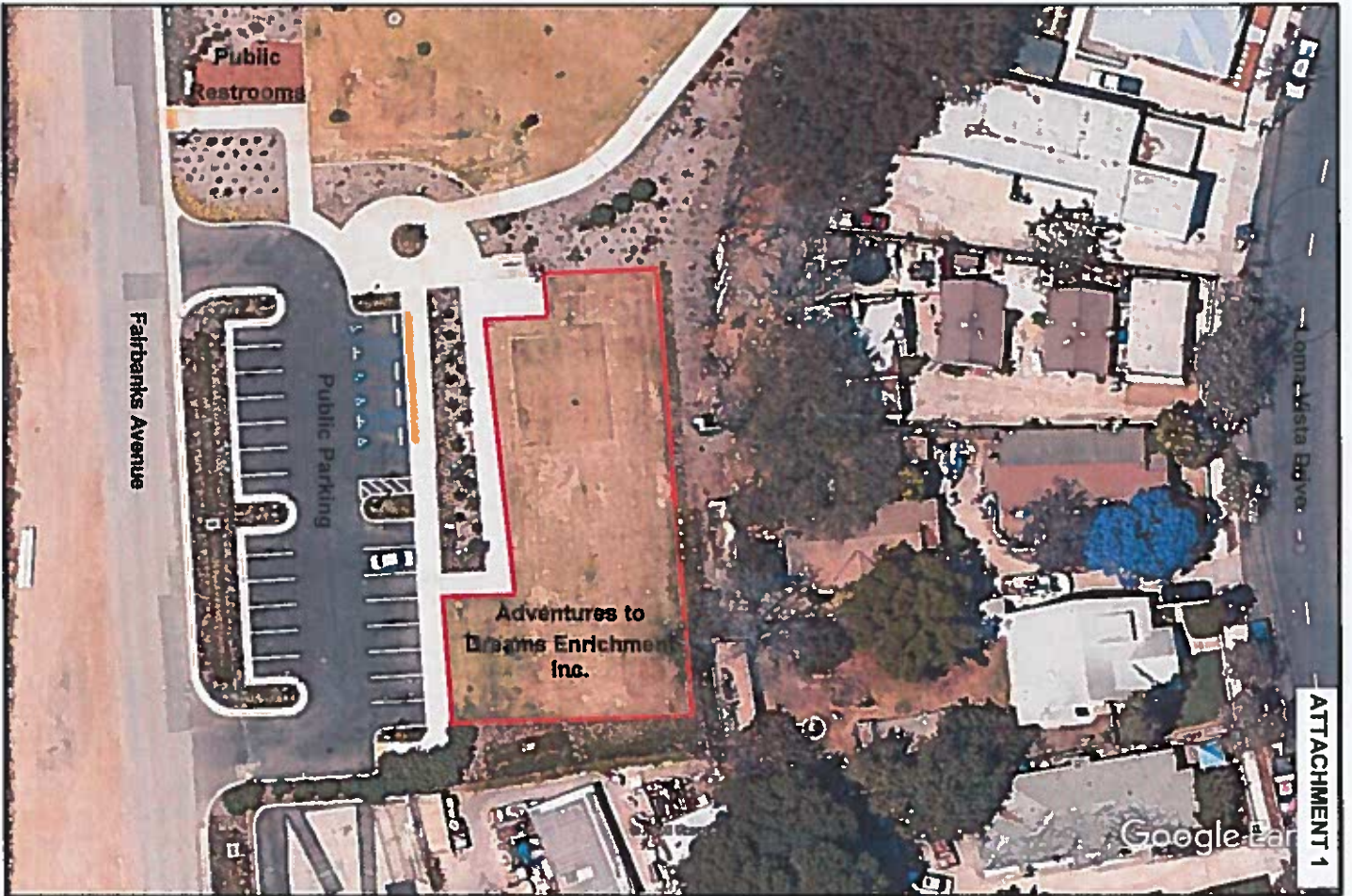
Location Map ADVENTURES TO DREAMS ENRICHMENT INC. At Drake/Chavez Greenbelt