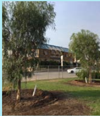
California Pepper Tree installed at the La Bella Flora Fontana Park.

The work involved removing eight decaying olive trees and two dead palm trees and installing eight new California Peppers and two new palm trees. They also made irrigation and electrical modifications, and added up lighting.