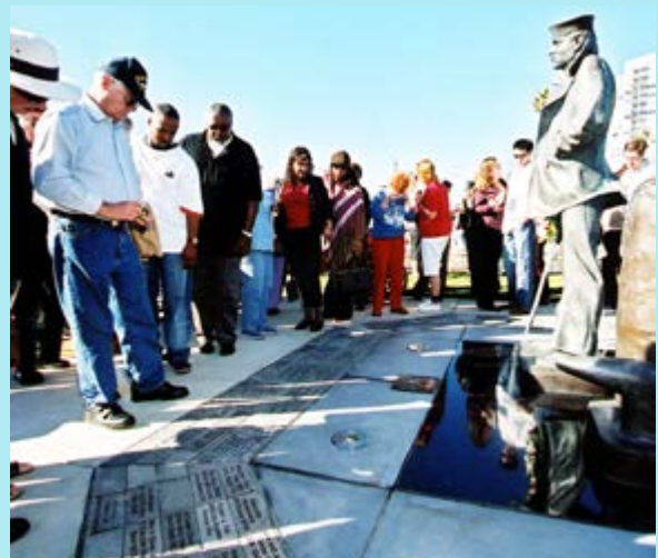
Crowds read memorial bricks at the opening of the Lone Sailor Memorial on October 13, 2004. Over 500 bricks have been purchased and installed to commemorate loved ones.

Over the past 15 years, family and friends have purchased bricks to honor their loved ones who served. To date, 525 bricks have been installed to create a lasting memorial. The Lone Sailor Memorial is located near Ocean Blvd. and Paloma Avenue.