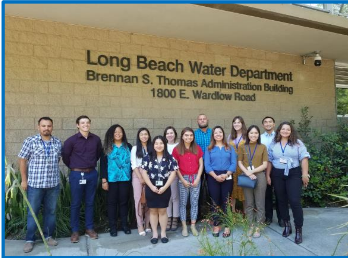
2019 Water Department Interns