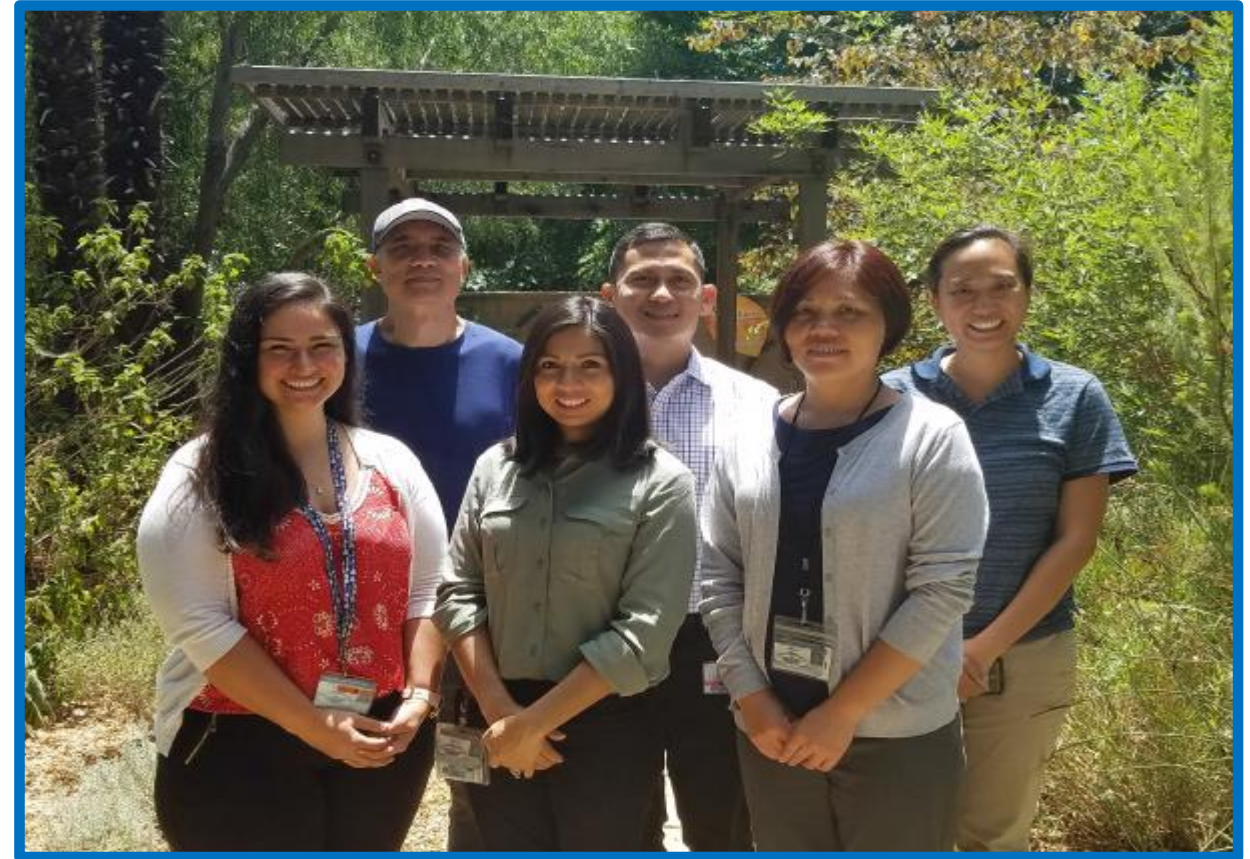
2019 Water Department Mentors