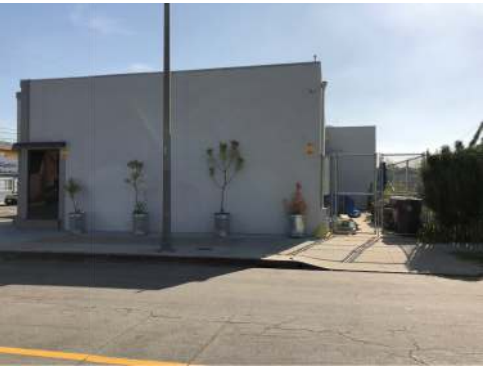
ADJACENT NORTH SIDE PROPERTY