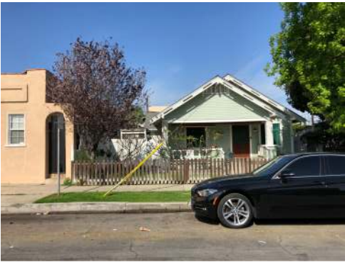
PROPERTY ACROSS THE STREET