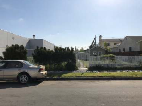
STREET VIEW OF PROPOSED GARAGE LOCATION