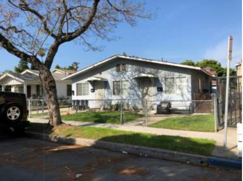
PROPERTY ACROSS THE STREET