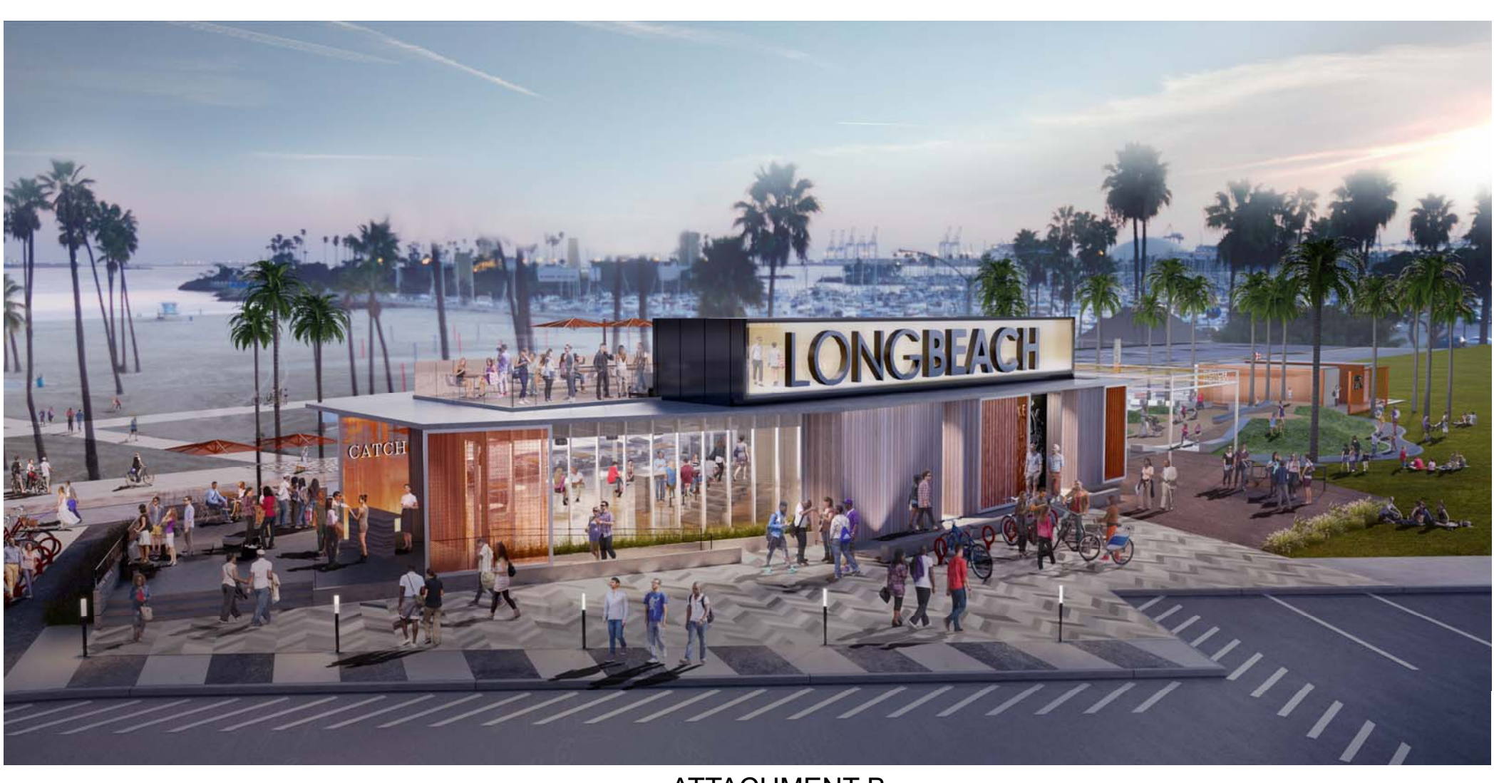
ATTACHMENT B CONCEPTUAL RENDERING