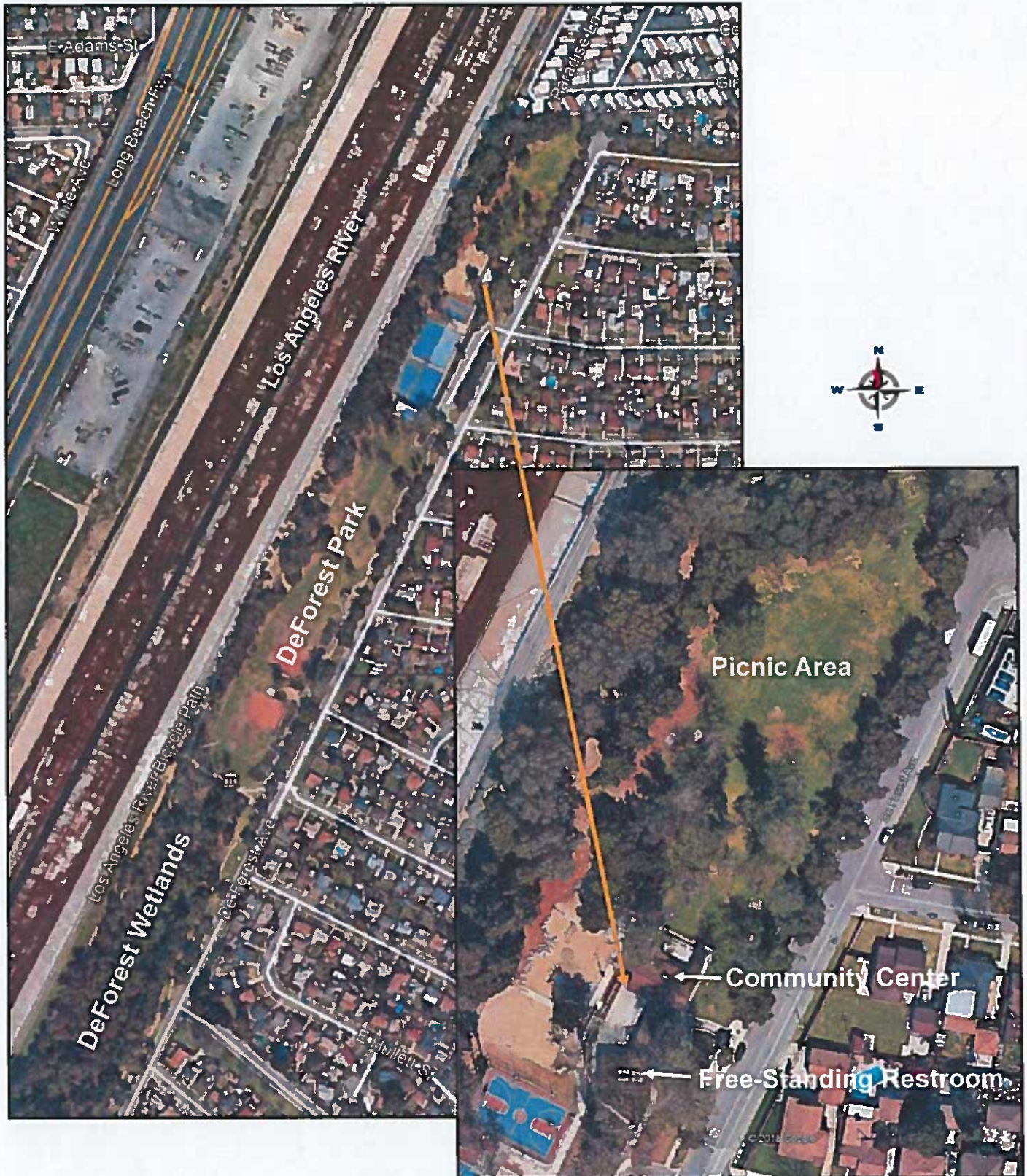
CAMP FIRE PROGRAMMING DeForest Park 6255 DeForest Avenue