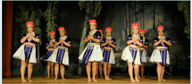
Hmong Association of Long Beach

Homeland is the recipient of the 2008 Dorothy Mullen Arts and Humanities Award from the National Recreation and Park Association and a 2012 Award of Excellence from the California Parks and Recreation Society.