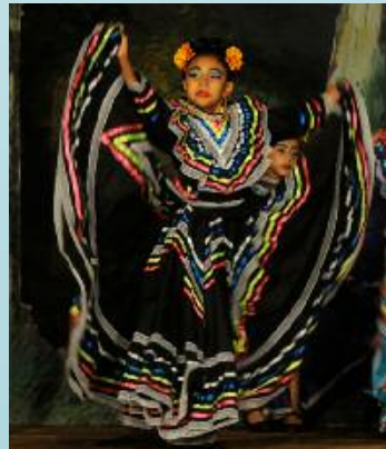
Paisajes de Mexico Ballet Folklorico