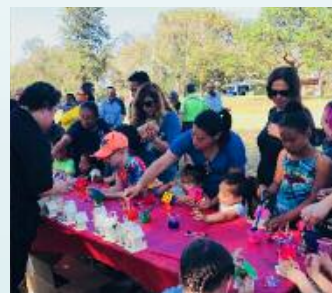
Kids have fun with the playground's tree house motif by painting bird houses.