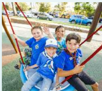
Four friends try out the new playground equipment.

This project and one completed in April at Jackson Park are the first two projects out of six planned with Measure A funds. New playgrounds at Drake, Jenni Rivera, Veterans and Whaley Parks will open later this year.