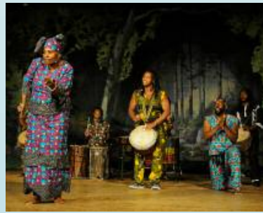
West African Drum and Dance