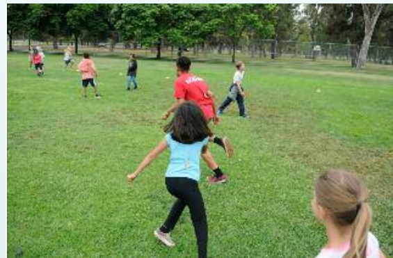
Clothes Pin Tag

Community park camps for ages 5-12 at El Dorado Park West, Silverado Park and Veterans Park offer arts and crafts, sports tournaments, games, field trips, swimming and more. The Hi Five Sports Camp at Pan American Park has a name that says it all. Campers sample a wide variety of sports over the summer as well as having fun with crafts, games and field trips.