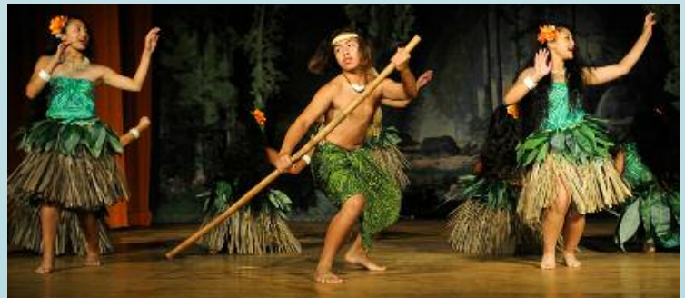
Kutturan Chamour Foundation