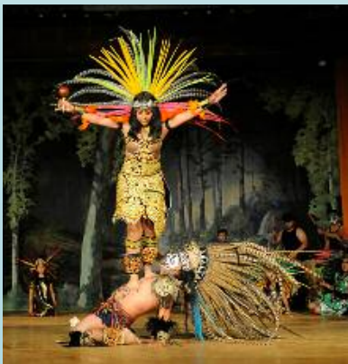
Xipetotec Long Beach