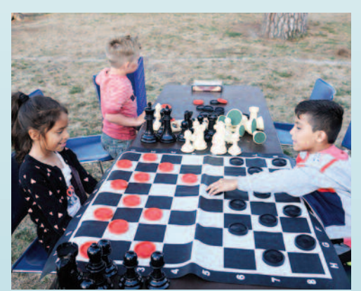
Chess, checkers and other board games are fun to play with new friends at Be SAFE nights.