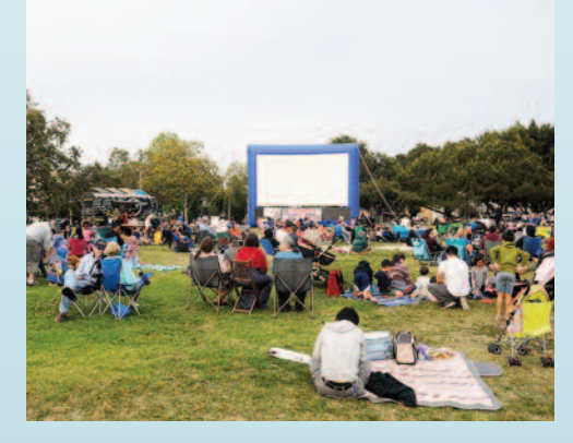
The Port of Long Beach sponsors free family friendly movies each week at Be SAFE events.