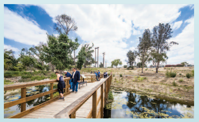
Walking, biking and equestrian trails; vernal pools, and habitat including native grasslands, coastal shrubs and oak-sycamore trees were developed or enhanced.

The total project cost was approximately $8.5 million, and was made possible using funds from Los Angeles County Proposition A, the California Resources Agency, California Coastal Conservancy, and the San Gabriel and Lower Los Angeles Rivers and Mountains Conservancy.