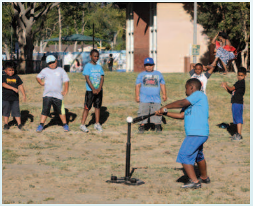
Youngsters hone their T-ball skills at Houghton Park.