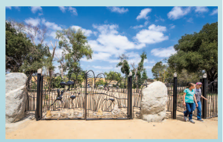
The entry gate designed by artist Brett Goldstone reflects the wildlife and natural elements of the adjacent Los Angeles River.