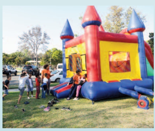
Kids look forward to pre-movie fun at Be SAFE events.