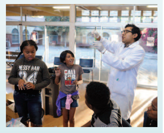
Workshops presented by Mad Science let curious kids and families discover the world around them.