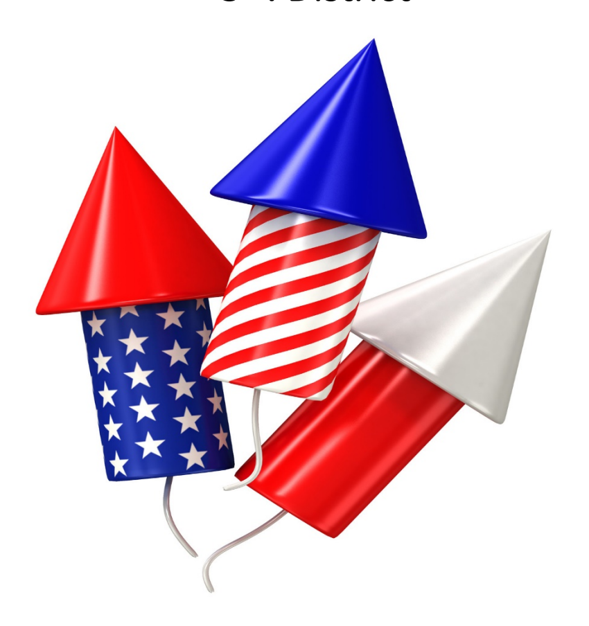
Fireworks Advisory Committee Recommendations 3<sup>rd</sup>. District