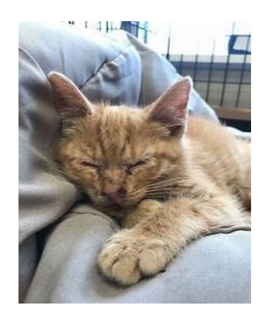
4<sup>th</sup>. July Impact Long Beach Animal Shelter