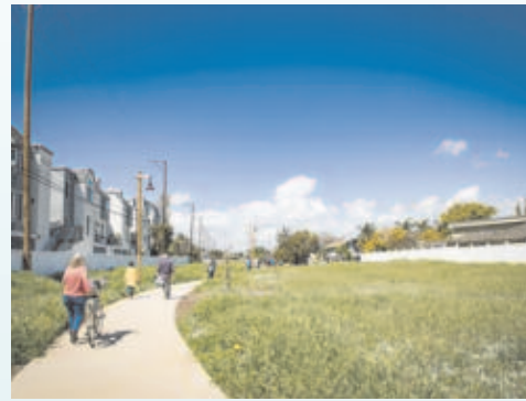
Red Car Greenbelt