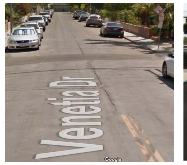
Measure A - $11,080,000