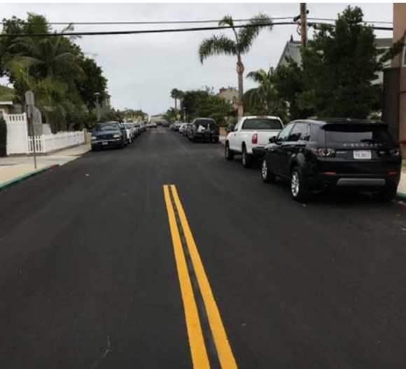
Other Funding - $4,500,000