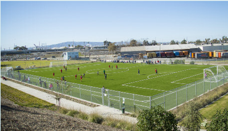
Players take to the new artificial turf field at Drake Chavez Park

A grand opening celebration for the new Drake Chavez Greenbelt and Artificial Turf Field at 1000 DeForest Avenue was held on January 20.