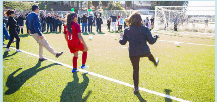
Celebrants line up for first kicks on the new field.