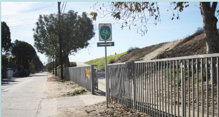
L.A. River Bike Path Entry near Willow and Golden Mini Park

Long Beach Parks, Recreation and Marine adopted the "Riverlink" Plan in 2003 to create open space along the L.A. River and make it more accessible to local neighborhoods that lack park space.