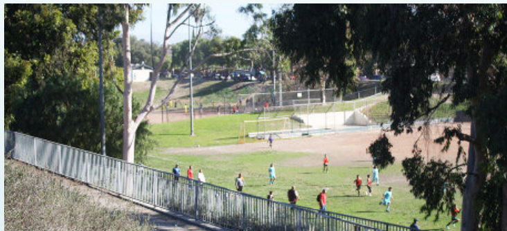
View of DeForest Park Sports Field from the Los Angeles River Bike Path