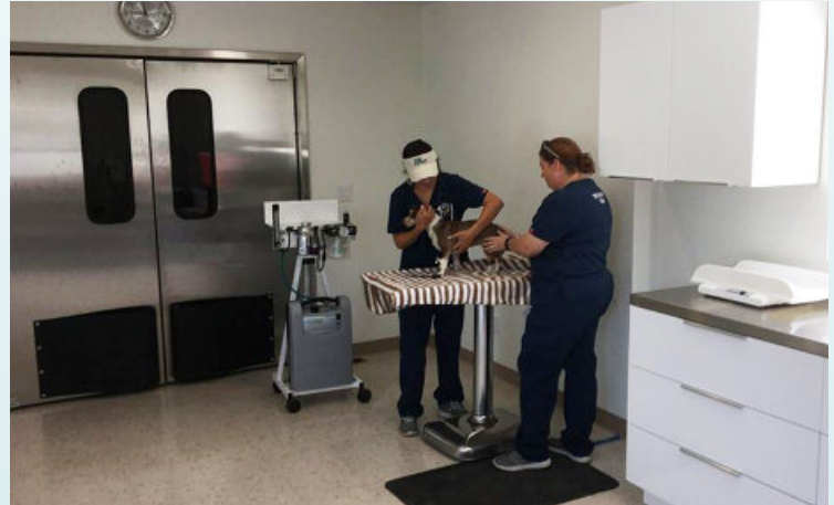
New Medical Suite Provides Additional Medical Treatment for Shelter Animals