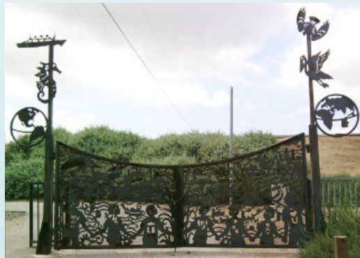
The Long Beach River Gate was dedicated in 2007 as part of the County of Los Angeles Earth Day Celebration. It is located near the Wrigley Greenbelt near 34th Street and DeForest Avenue.