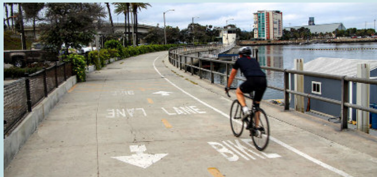
The Los Angeles River Trail ends in Long Beach at Shoreline Drive near Shoreline Park