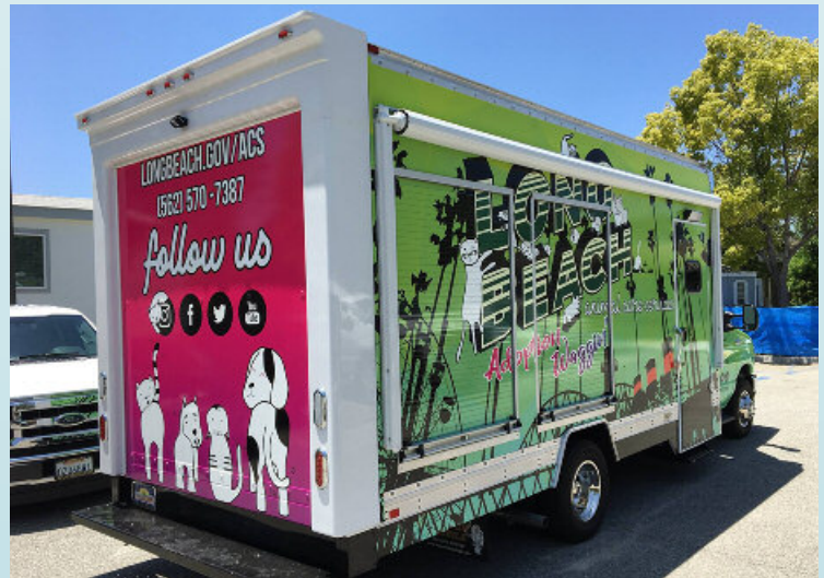
Mobile Adoption Van Connects People and Pets Throughout the Community