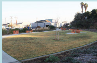
Residents have new open space and picnic areas to enjoy.

The walkability factor in Long Beach just grew with a new walking path that traverses the 8.75 acre park space.