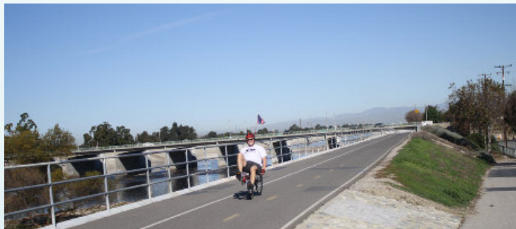
A recumbent bike rider glides along L.A. River Bike Path near Willow and Golden Mini Park

The Los Angeles River Bikeway Class I bicycle and pedestrian path known as LARIO, is a smooth, unbroken expanse of car-free bike riding that extends nearly 20 miles from the City of Vernon to Long Beach. Riders travel along dry river beds and discover Long Beach's "bikeability" amongst the grass and foliage of Queensway Bay and the Queen Mary.