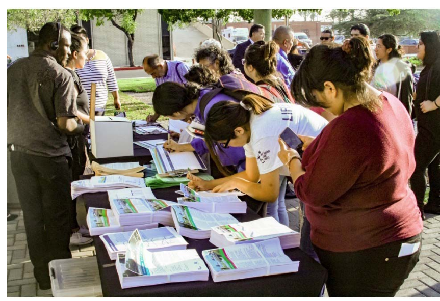
Over 280 people attended the Public Hearings

Results in an Estimated Total of 2,200 to 2,500 Individual Public Comments