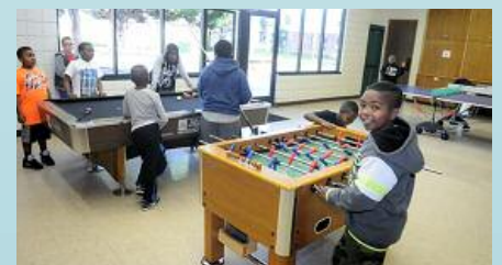
M.L. King Jr. Park