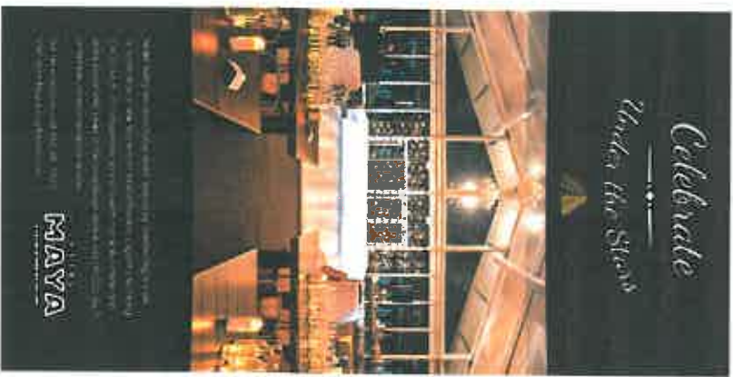
S P O N S O R (http://lbpost.com/ads)

do so by December 29 The structure, which sits nearest to the historic terminal, will officially close on January 7 for renovations, while the last group of those permitted to park must