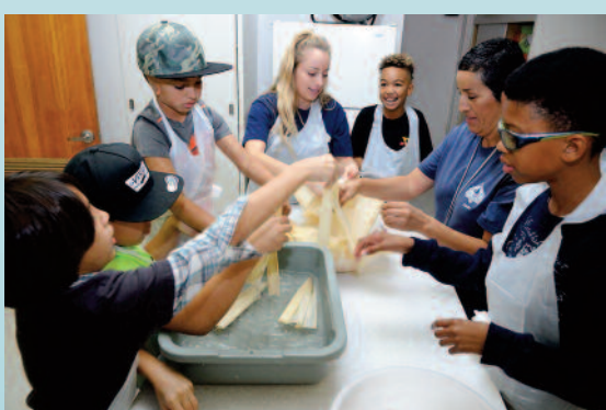
Whaley Park Tamale Making