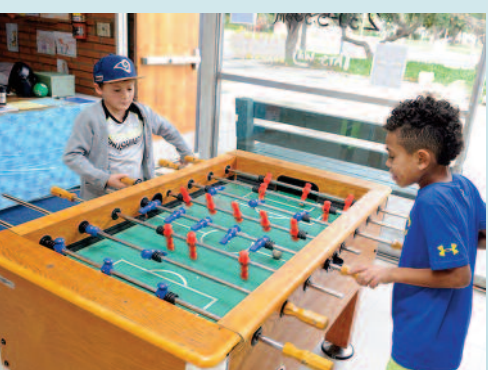
Whaley Park Foosball Fun