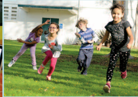
Hooray for Winter Break Fun Days at Pan American Park