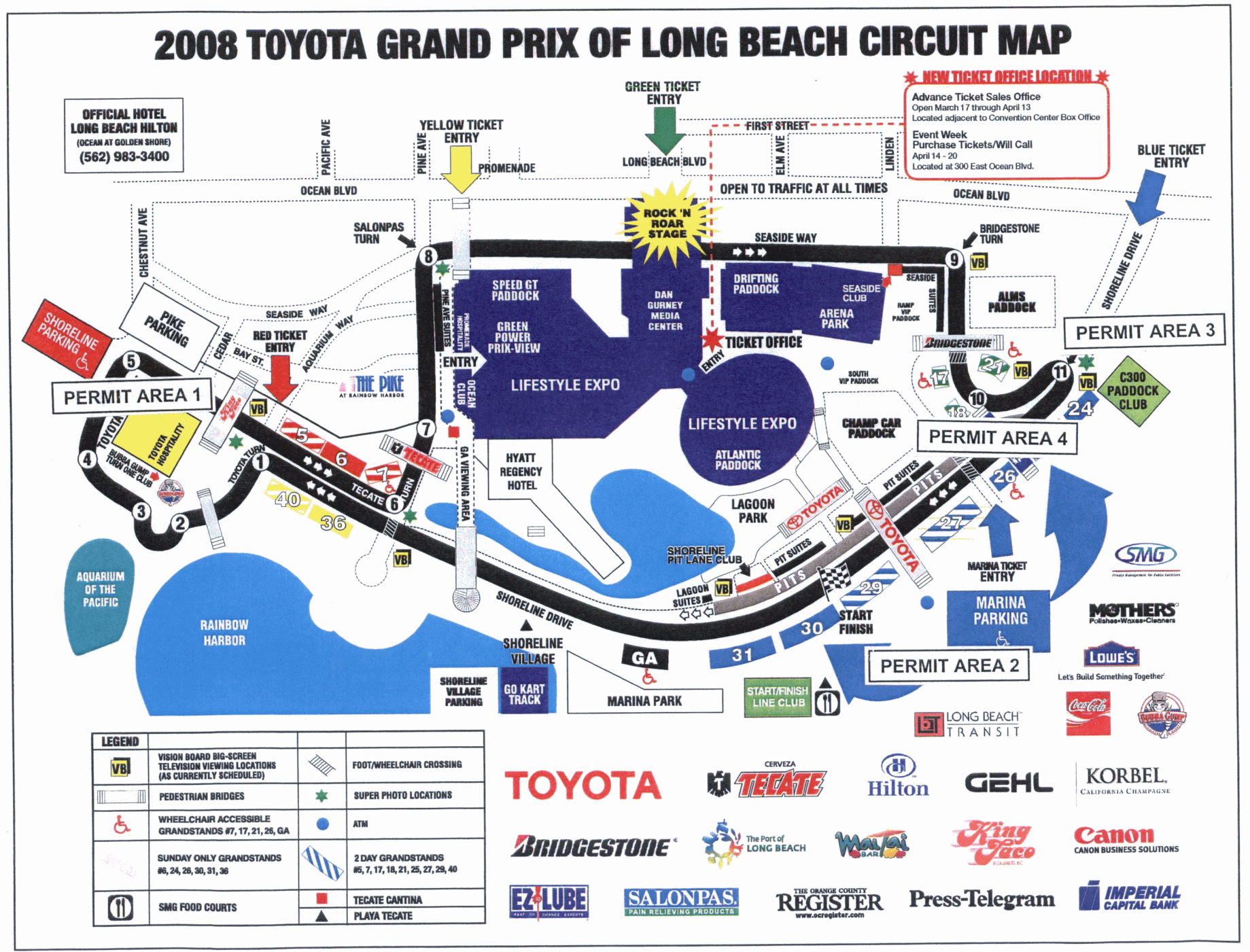
EXHIBIT A - PARKING PERMIT ACCCESS