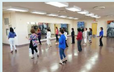
MacArthur Park Renovation

Staff submitted 47 park projects for the LA County Parks and Recreation Needs Assessment for ballot