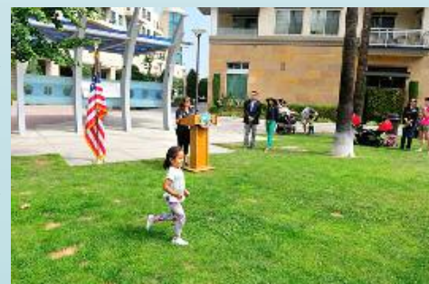
Promenade Park Tot Lot

Measure M, which passed in November. Completed park development projects included the Long Beach Greenbelt from Termino to 7 th Street, the Bixby Park Restroom, the Locust Tot Lot, Recreation Park Sand Volleyball Court, Promenade Park Tot Lot, Chavez Park Fitness Station, 14th Street Park/Seaside Park upgrades, Mac Arthur Park and Homeland Cultural Center renovations, and conceptual plans for Davenport Park Phase II.