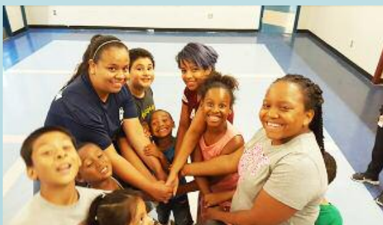
Be SAFE Program

LBPRM contributed to public safety. The BE S.A.F.E. program (Summer Activities in a Friendly Environment) reduced crime by keeping seven parks open late for organized games and activities from June 20 through August 26.