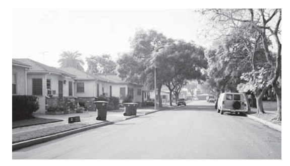
Existing single-family residential neighborhood in North Long Beach