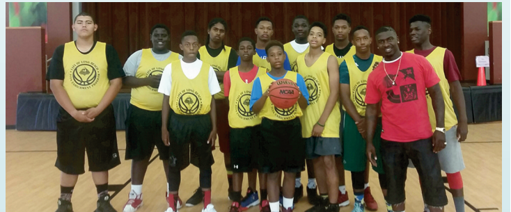
M.L. King Jr. Park