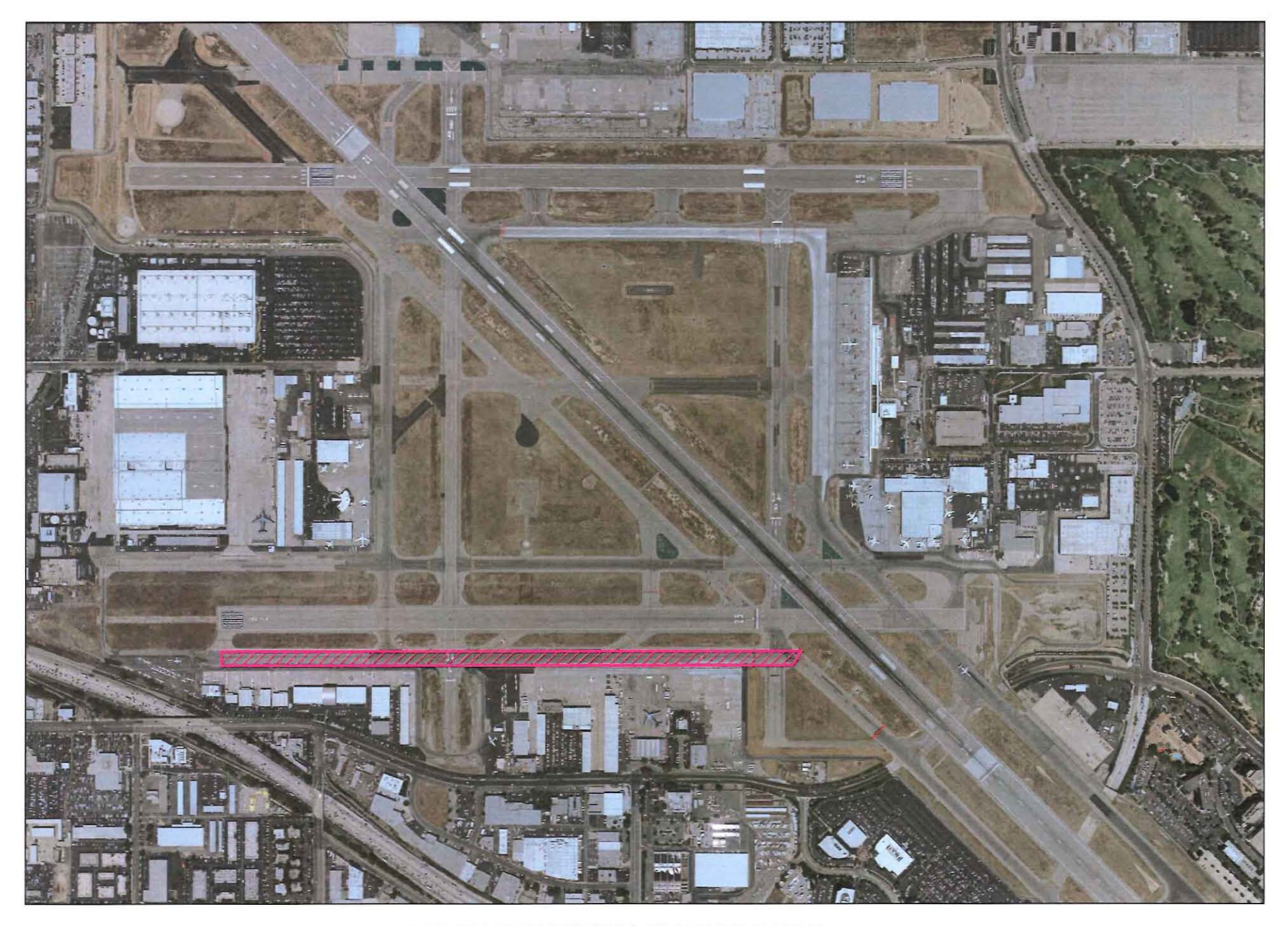
RECONSTRUCTION OF TAXIWAY F