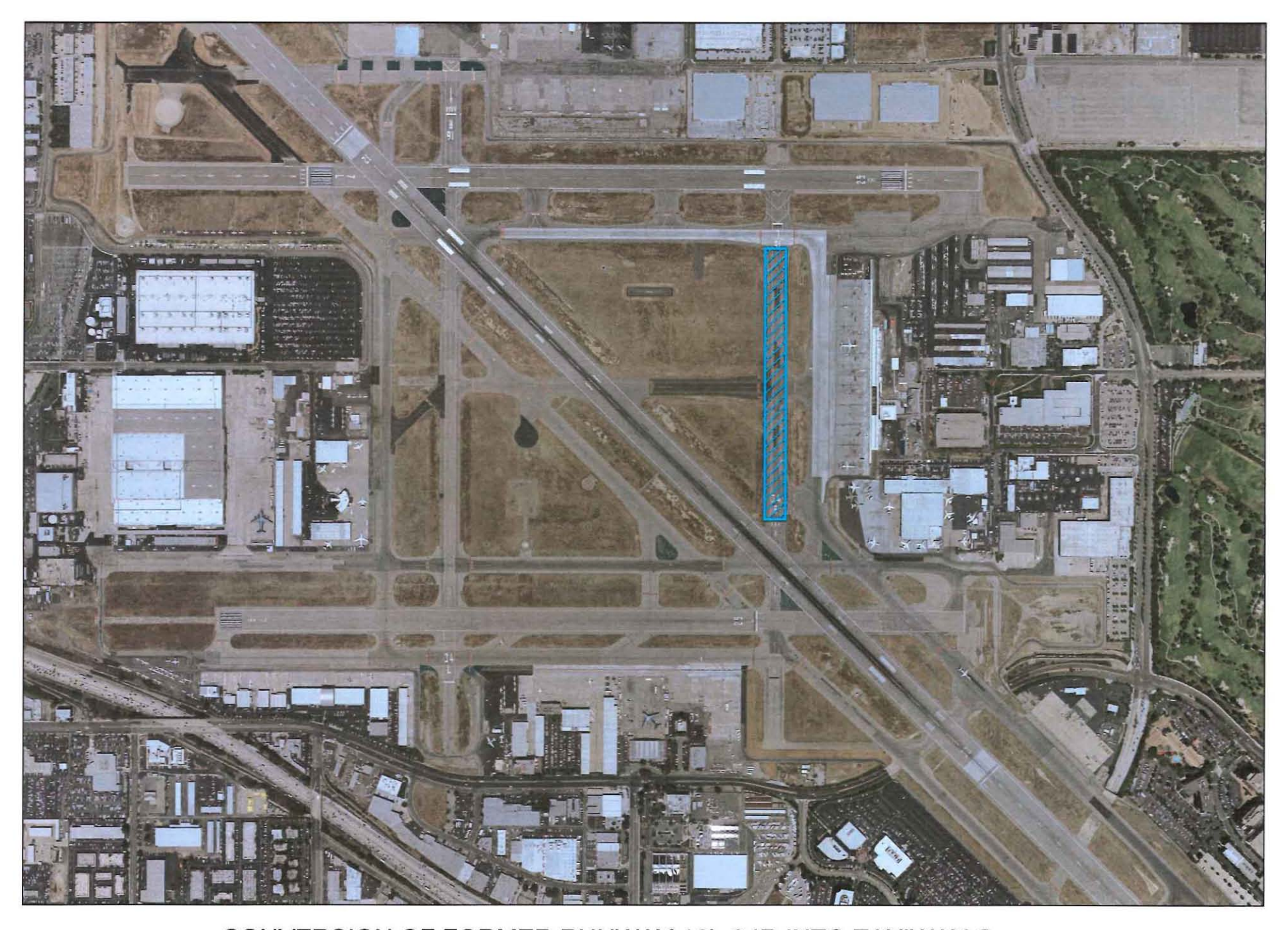
CONVERSION OF FORMER RUNWAY 16L-34R INTO TAXIWAY C