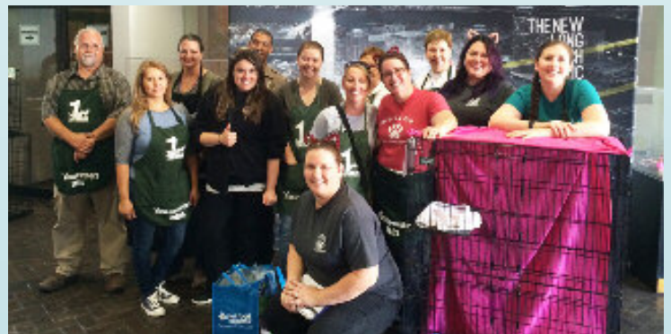
The LBACS team including office staff, medical team, Animal Control Officers and dedicated volunteers made the 2nd Kitty Hall a success.