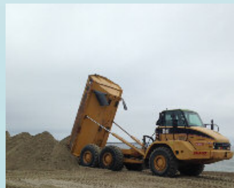
Beach Maintenance staff manage beach erosion by shifting sand from the west beach to the east beach.

They also construct sand berms as far away from homes as practical and attempt to keep the berms high enough to be effective, yet low enough to provide a view.