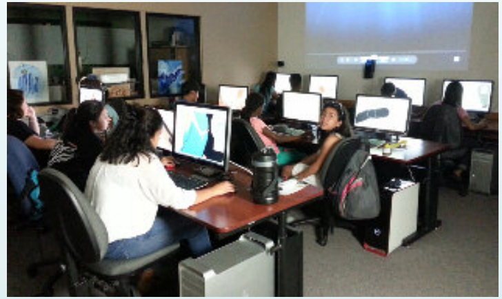
Houghton Park Digital Academy

The Long Beach City Council is supporting the program with $186,000 in funding. For more information about BE S.A.F.E. activities, visit www.lb parks.org .