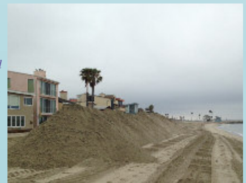
Staff maintains sand berms to protect homes in low lying areas from possible flooding.