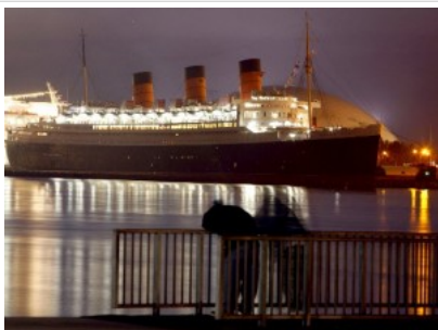
For the first time since the airline started serving California in 1982, Southwest will fly to Long Beach. Above, the city's most famous tourist attraction, the Queen Mary, is docked at Long Beach Harbor.

This June, Southwest ( https://www.southwest.com/ ) will fly to Long Beach ( http://www.visitlongbeach.com/ ) for the first time in the airline's history.