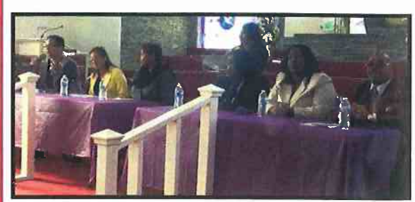
Pieces of Hope panelists. The PRC presented a "Real Talk" discussion on Teen Dating Violence, Healthy Relationships & Healing.

The PRC is an approved service provider for youth leadership in Los Angeles County. We are Certified Advocates in Domestic Violence, Sexual Assault & Gang Alternative Prevention.