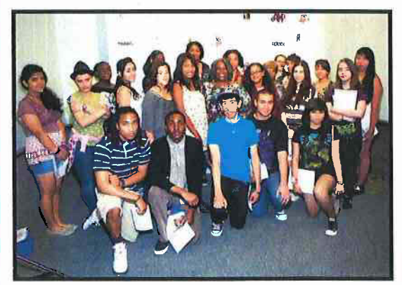
Students at Stop The Pain, Teen Summit. The PRC created this event to educate young adults about bullying and dating violence , and how to bring an end to them.

The Positive Results Corporation teaches leadership and character development skills in order to promote healthy, sustainable relationships, and prevent acts and exposure to violence and high risk behaviors.