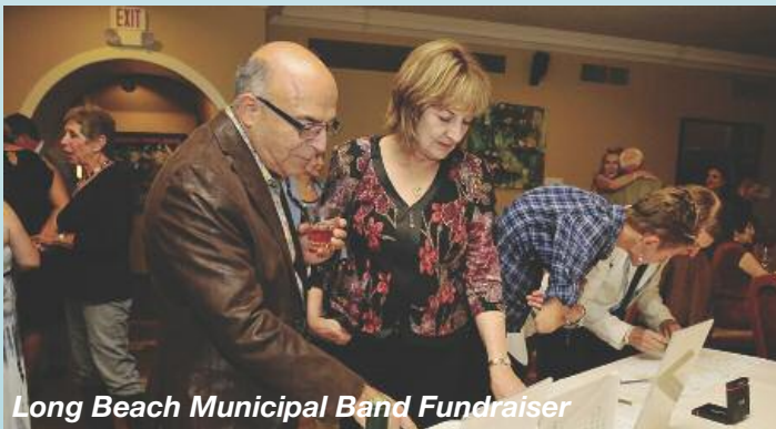
Long Beach Municipal Band Fundraiser

Partners of Parks helps to ensure the safety and beauty of Long Beach parks and recreational facilities. POP support helped to open Baker Park, Chittick Field, the DeForest Futsal Courts, Dog Parks, Lilly Park, Livingston Drive Playground and the Orizaba Park Community Center. POP has supported the “KaBoom” playground program, the Lone Sailor memorial, universally accessible playgrounds, and the repair of the Bixby Park Band Shell. POP helps preserve natural resources by assisting local groups with “Adopt-a-Park” and beach cleanup events.