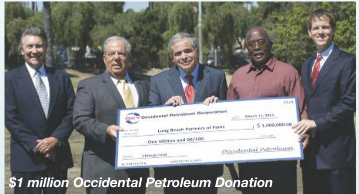
$1 million Occidental Petroleum Donation

While the demand for Partners of Parks services have continually increased, POP's operating budget has not been augmented in over ten years. To enhance and add to the services that can be provided, POP is launching its first campaign to raise funds for its operation. The “30 for 30” Campaign has a goal to raise $30,000 for the 30-year old Partners of Parks in 2015.