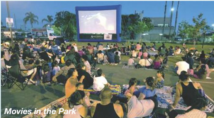
Movies in the Park

Since 1985 the non-profit organization Partners of Parks (POP) has raised funds for Long Beach recreation programs such as after school programs at parks, El Dorado Nature Center programs, junior golf and tennis programs, the Long Beach Municipal Band, Movies in the Park, senior citizen and teen programs, youth sports leagues, special events like “Snow Days,” and Youth Assistance Scholarships to ensure access to fee-based recreation programs for low-income youth.